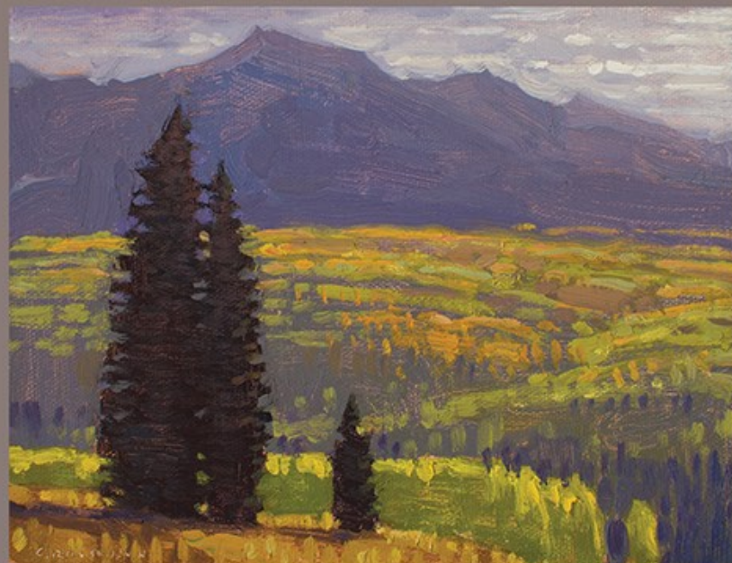
Kebler Pass Groves in Afternoon Light, 6 x 8, oil