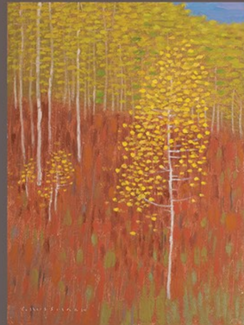
Aspen Saplings in Autumn Morning Colors, 8 x 6, oil