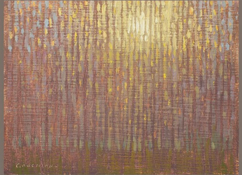
Late Summer Forest with Setting Sun, 6 x 8, oil