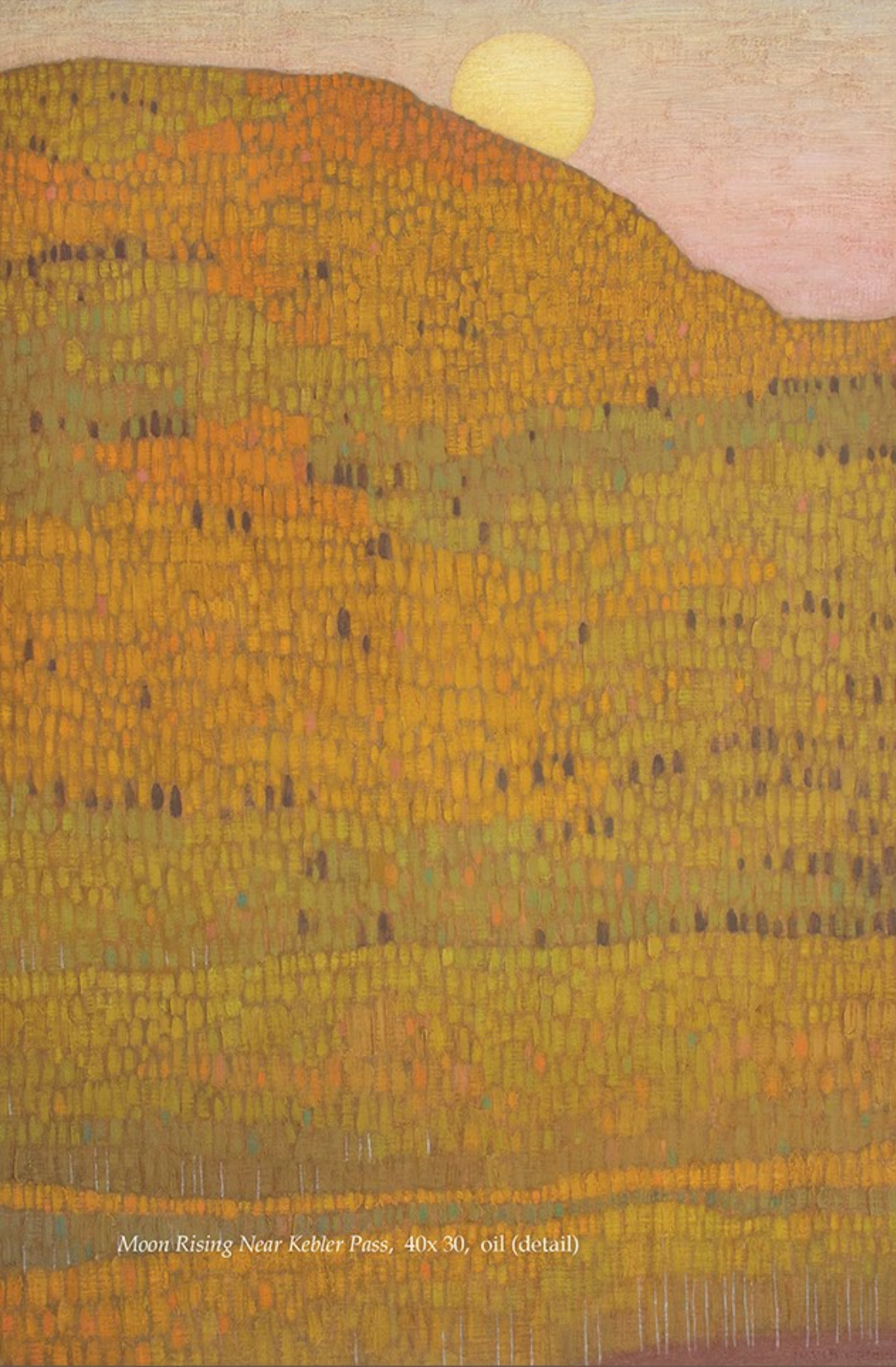
Moon Rising Near Kebler Pass, 40x 30, oil (detail)