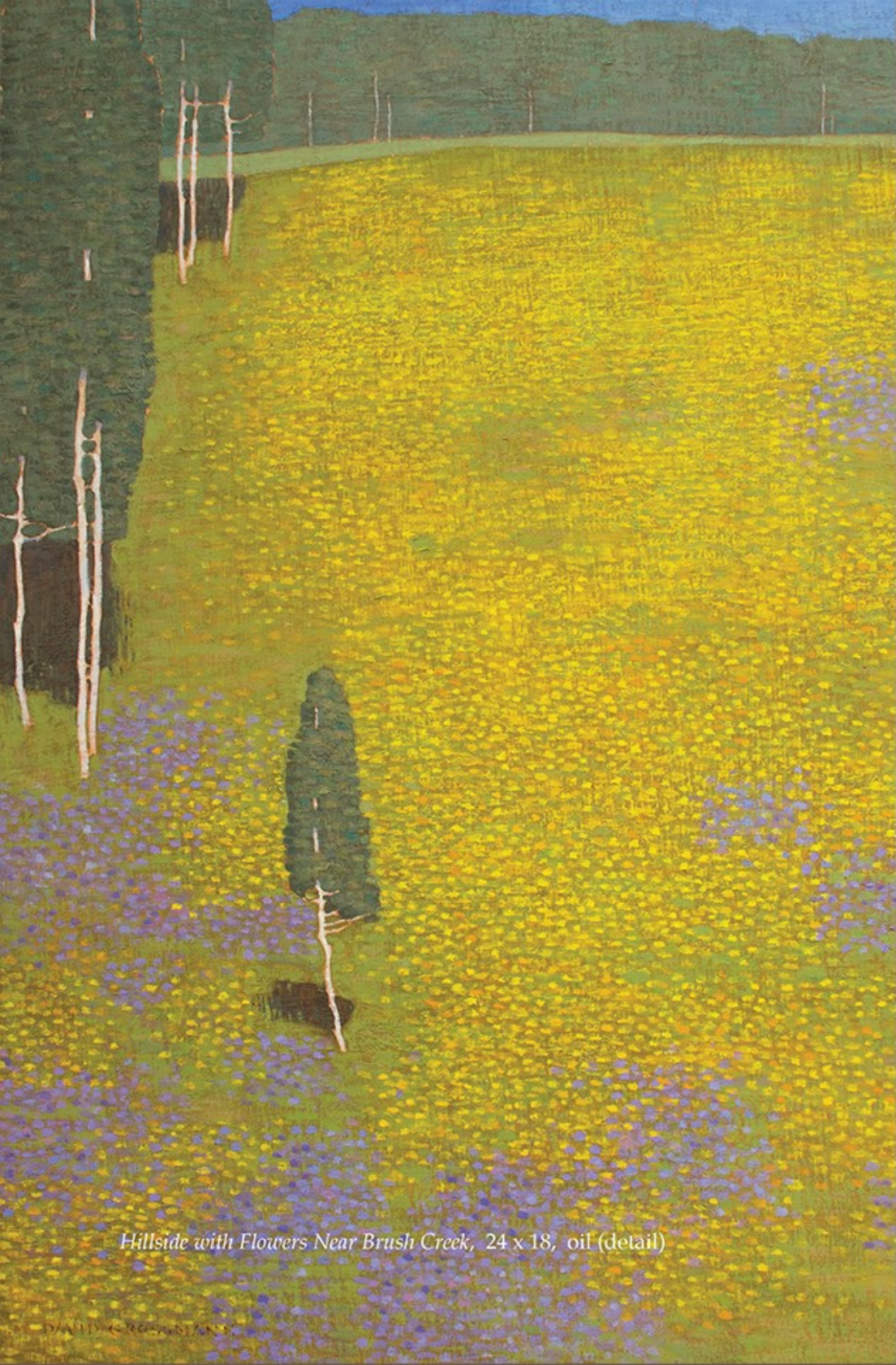
Hillside with Flowers Near Brush Creek, 24 x 18, oil (detail)