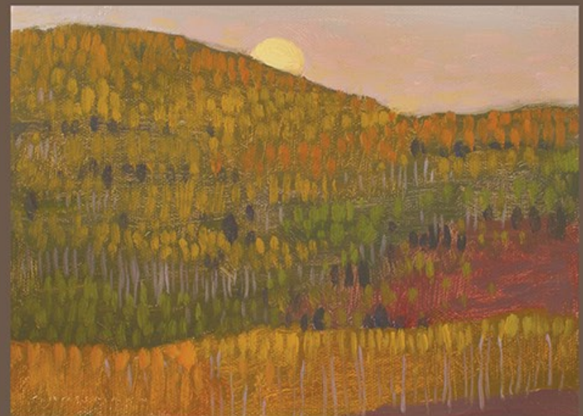
Autumn Moon Setting Near Kebler Pass , 8 x 6, oil