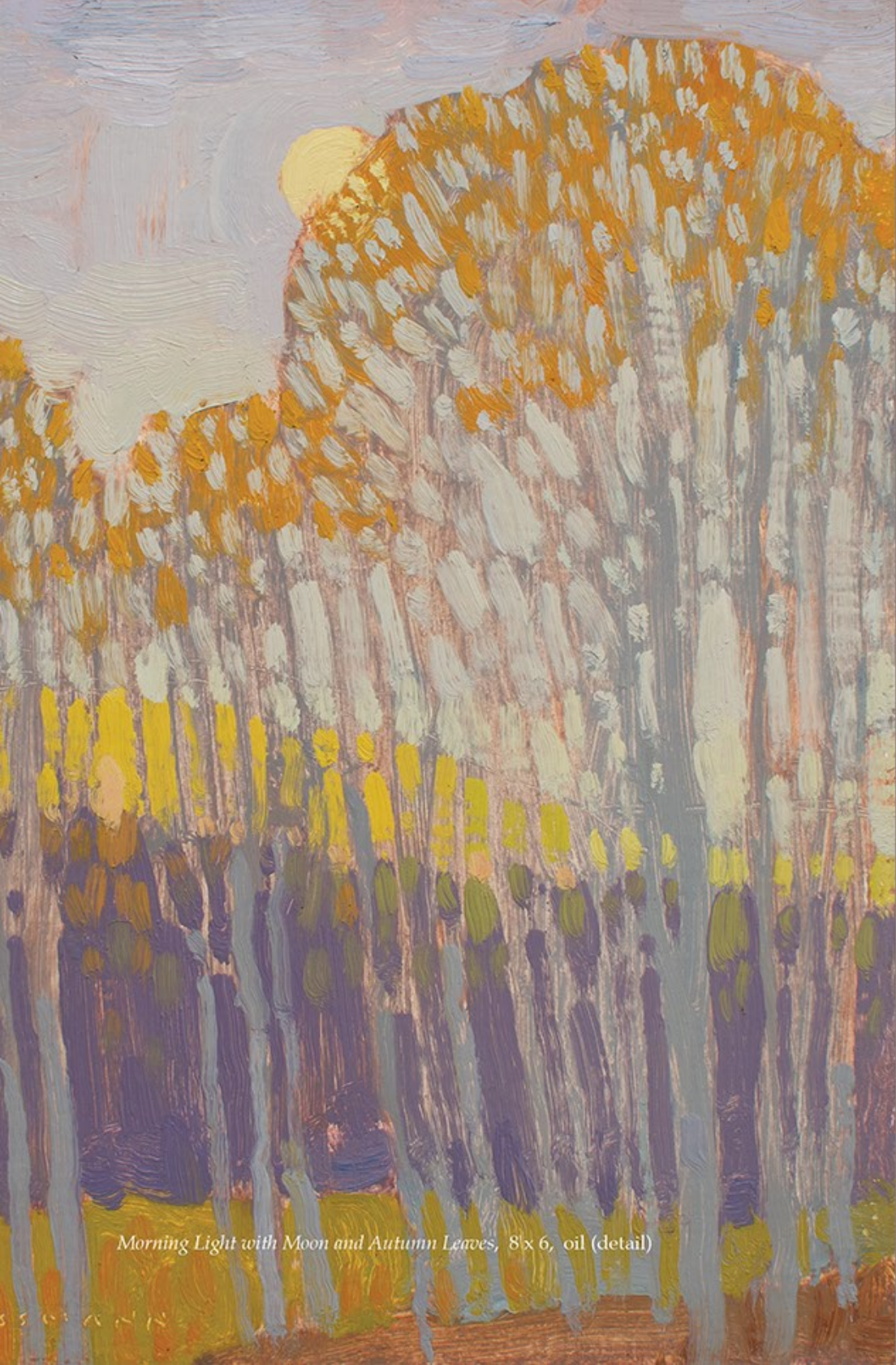
Morning Light with Moon and Autumn Leaves, 8 x 6, oil (detail)