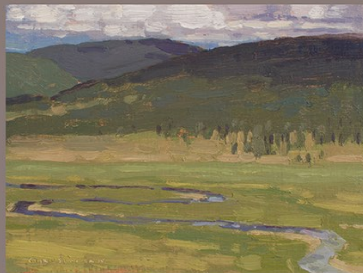
Brush Creek View, 6 x 8, oil