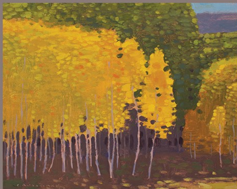
Autumn Meadow Light, 8 x 10, oil