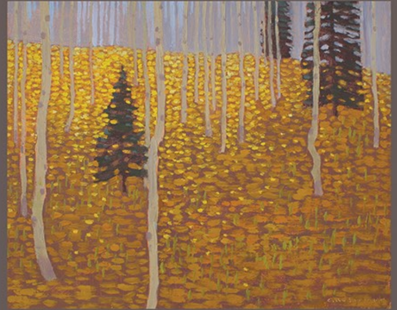
Hill with Pines and Fallen Aspen Leaves, 8 x 10, oil