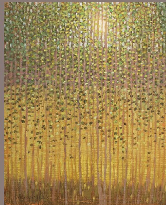
Sun Through Summer Aspen Leaves, 10 x 8, oil