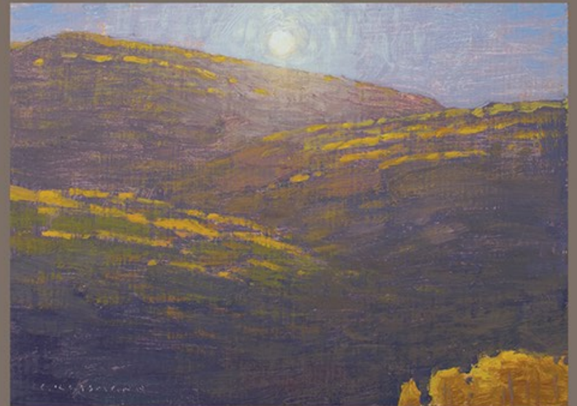
Morning Autumn Sun Near Kebler Pass, 6 x 8, oil