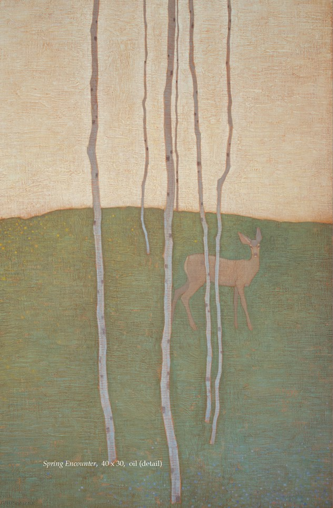
Spring Encounter, 40 x 30, oil (detail)