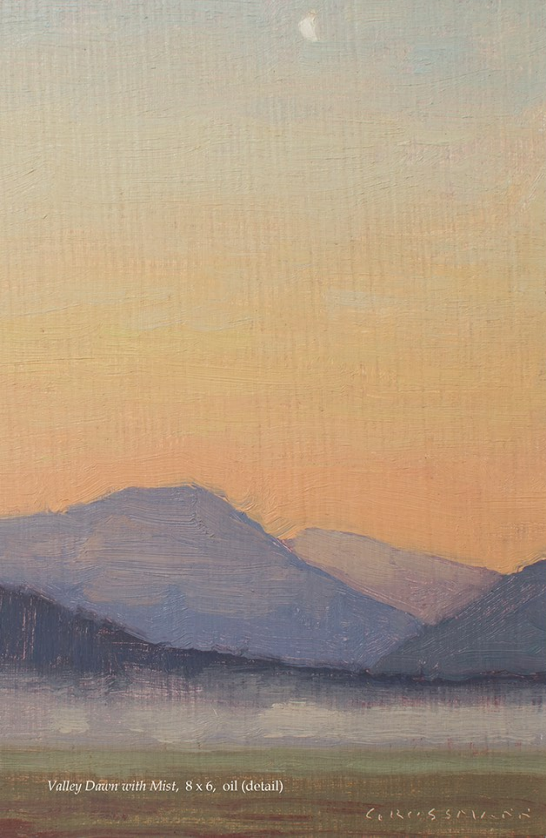
Valley Dawn with Mist, 8 x 6, oil (detail)