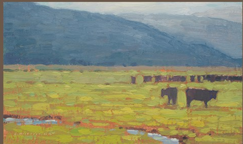
Morning Cows Near Crested Butte , 7 x 12, oil

visit our website at ohbejoyfulgallery.com for details