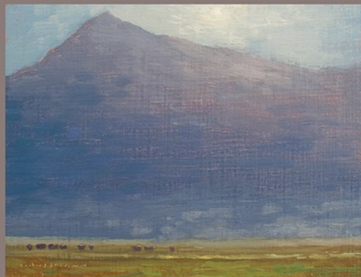
Crested Butte and Morning Pasture, 6 x 8, oil