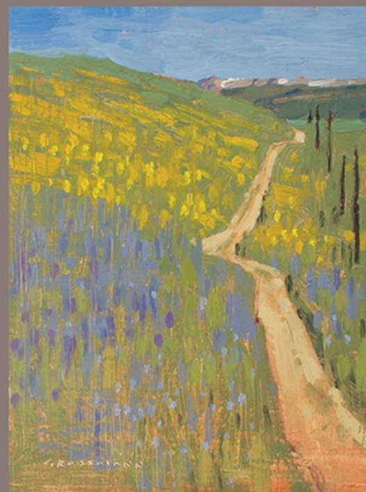
Path and Wildflowers, 8 x 6, oil