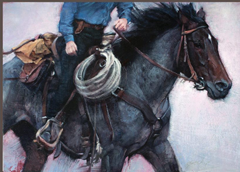
Jill Soukup Queenie & Kate , 14 x 20, oil