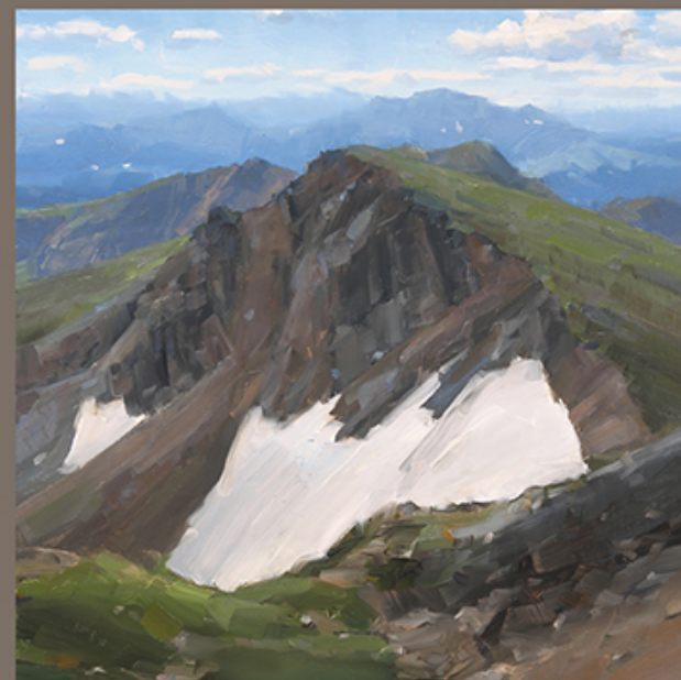
Dave Santillanes The Medicine Bows (study) , 12 x 12, oil