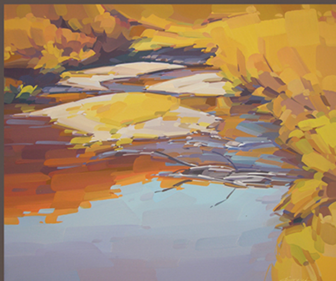
Mick Shimonek Coal Creek Calm , 26 x 31, oil