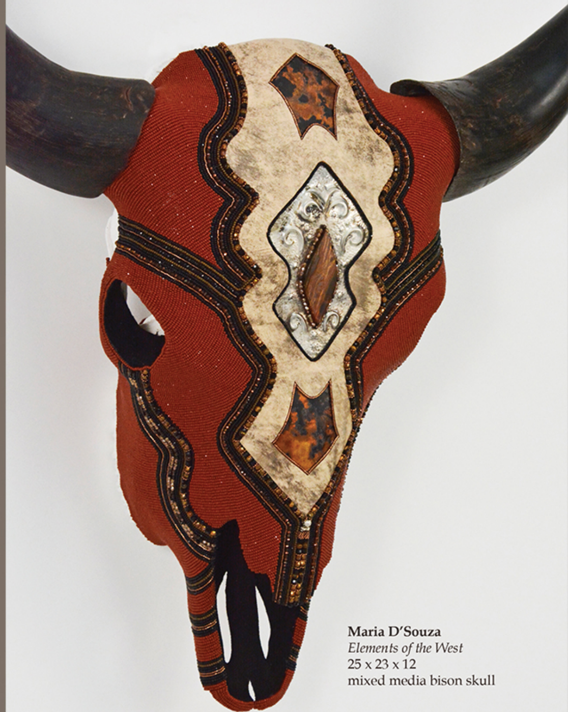
Maria D'Souza Elements of the West 25 x 23 x 12 mixed media bison skull