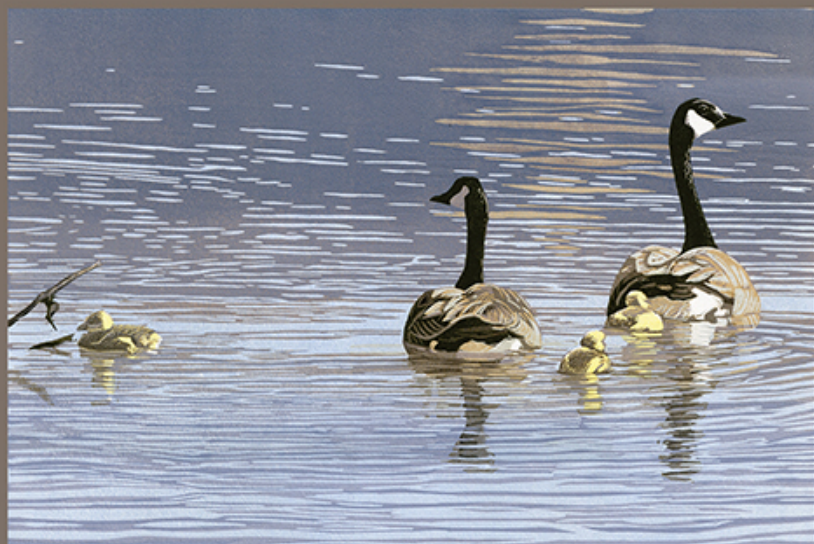
Sherrie York Come Along, Dear , 12 x 18, linoleum block print