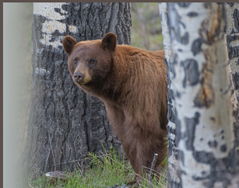
Constance Mahoney Forest Queen , 24 x 24, Photo on metal