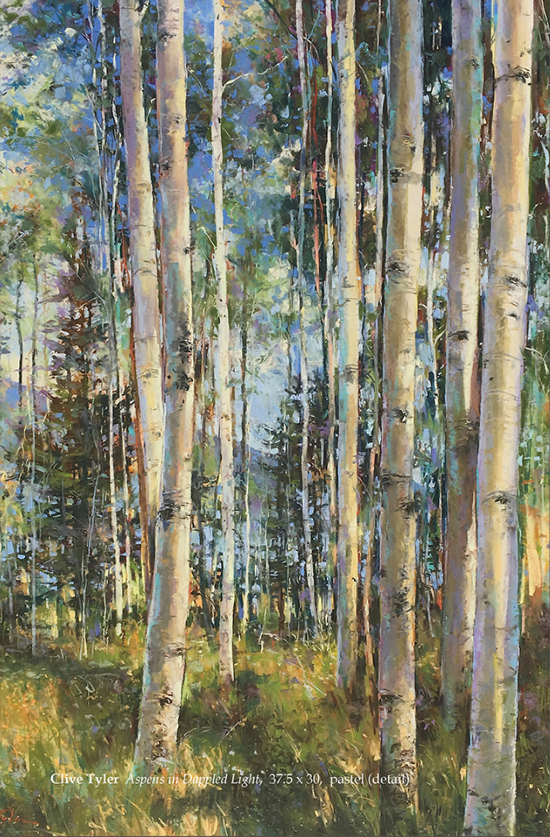
Clive Tyler Aspens in Dappled Light , 37.5 x 30, pastel (detail)