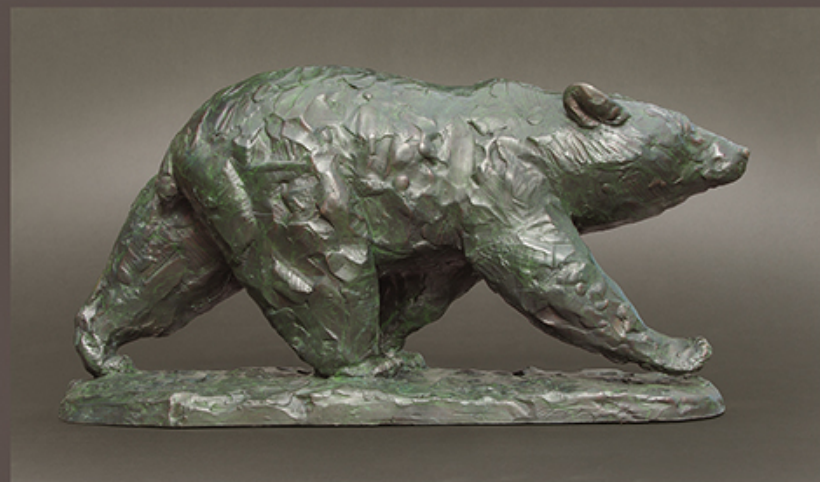
George Bumann Going Places , 14.25 x 4.25 x 7.25, bronze