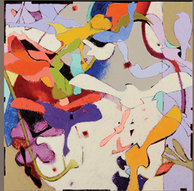
Shirley Novak Swoops , 30 x 30, acrylic