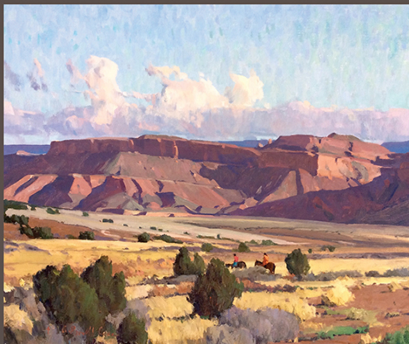
G. Russell Case Waheap Mesa , 20 x 24, oil