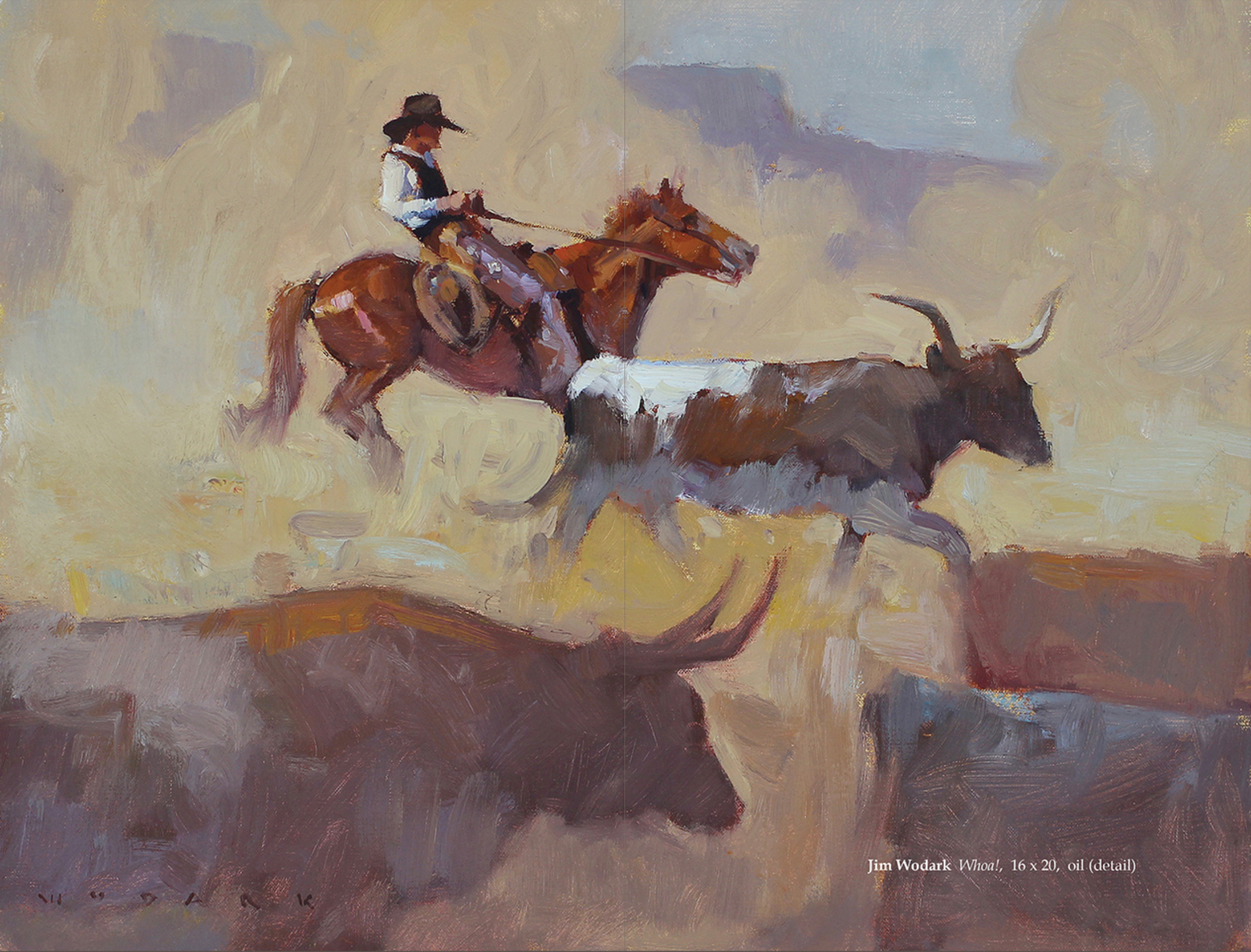
Jim Wodark Whoa! , 16 x 20, oil (detail)