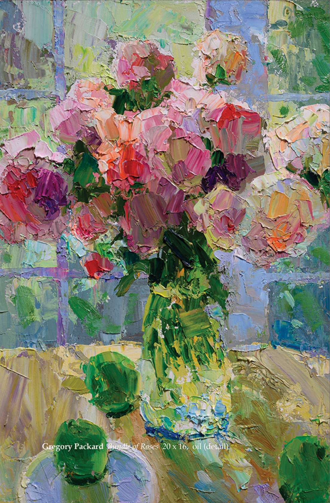
Gregory Packard Bundle of Roses 20 x 16, oil (detail)