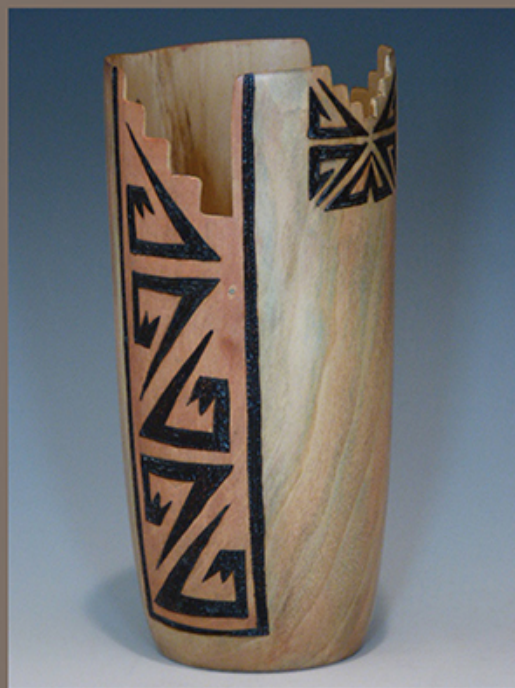
William Folger Pueblo Vase , Cottonwood, 7.5 x 3.25, woodturning