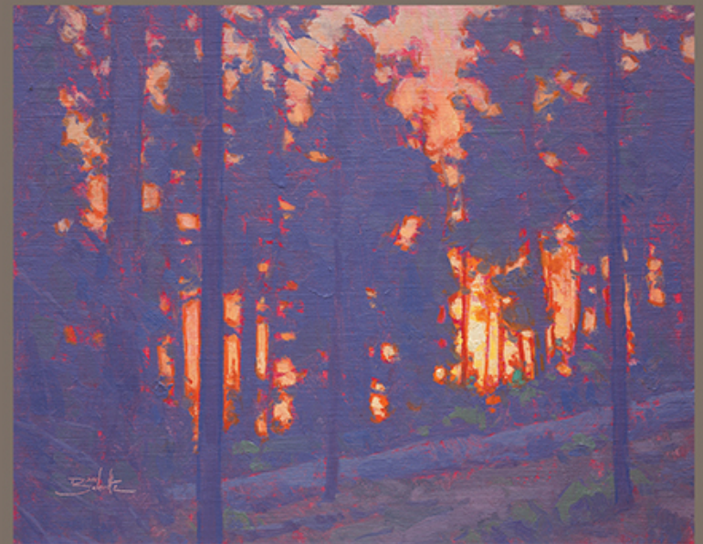
Dan Schultz Forest Sunset , 11 x 14, oil