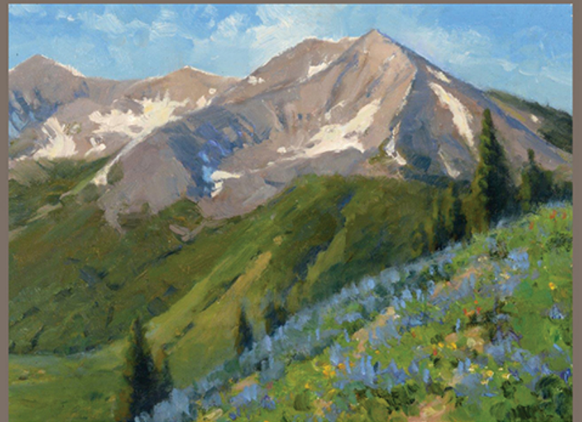
Ralph Oberg When the Lupine Bloom , 12 x 16, oil