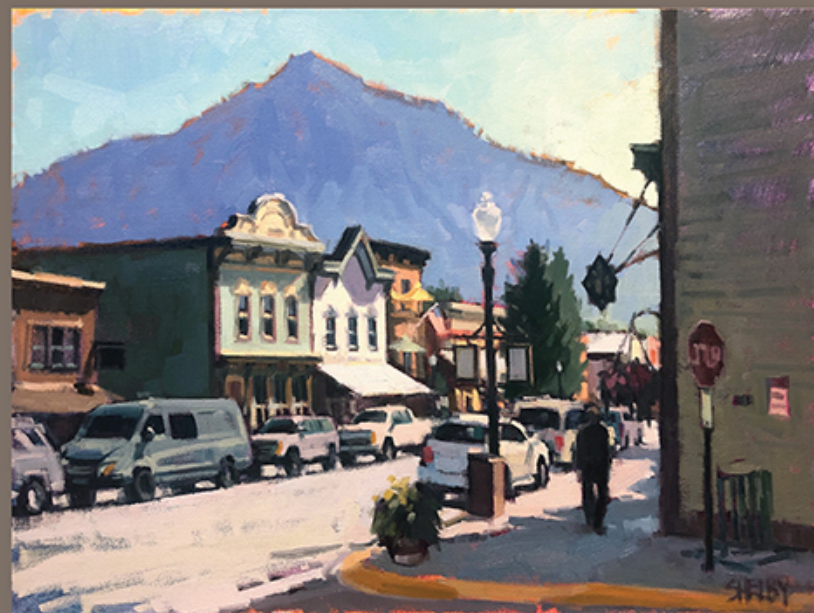
Shelby Keefe Mountain Town , 18 x 24, oil