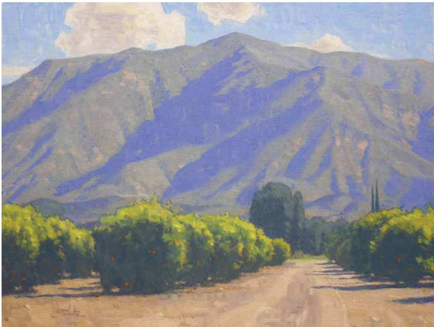
Ojai Morning Light, oil, 18 x 24.

Schultz's compositions aren't always a direct representation of nature but a reflection of what he's exploring with color. As such, sometimes he paints literal colors, while other times he pushes the hues to be brighter or more intense, amplifying the light as if he's peeling off layers to reveal light trapped inside. "It's made me feel like I can exercise some more creativity, rather than matching what I see or copying it down," says Schultz about this approach. "I'm able to take what I'm seeing but manipulate it toward this color range that I find intriguing."