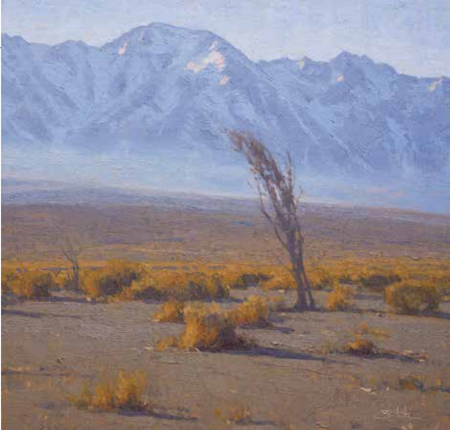
Voices on the Wind, oil, 18 x 18.