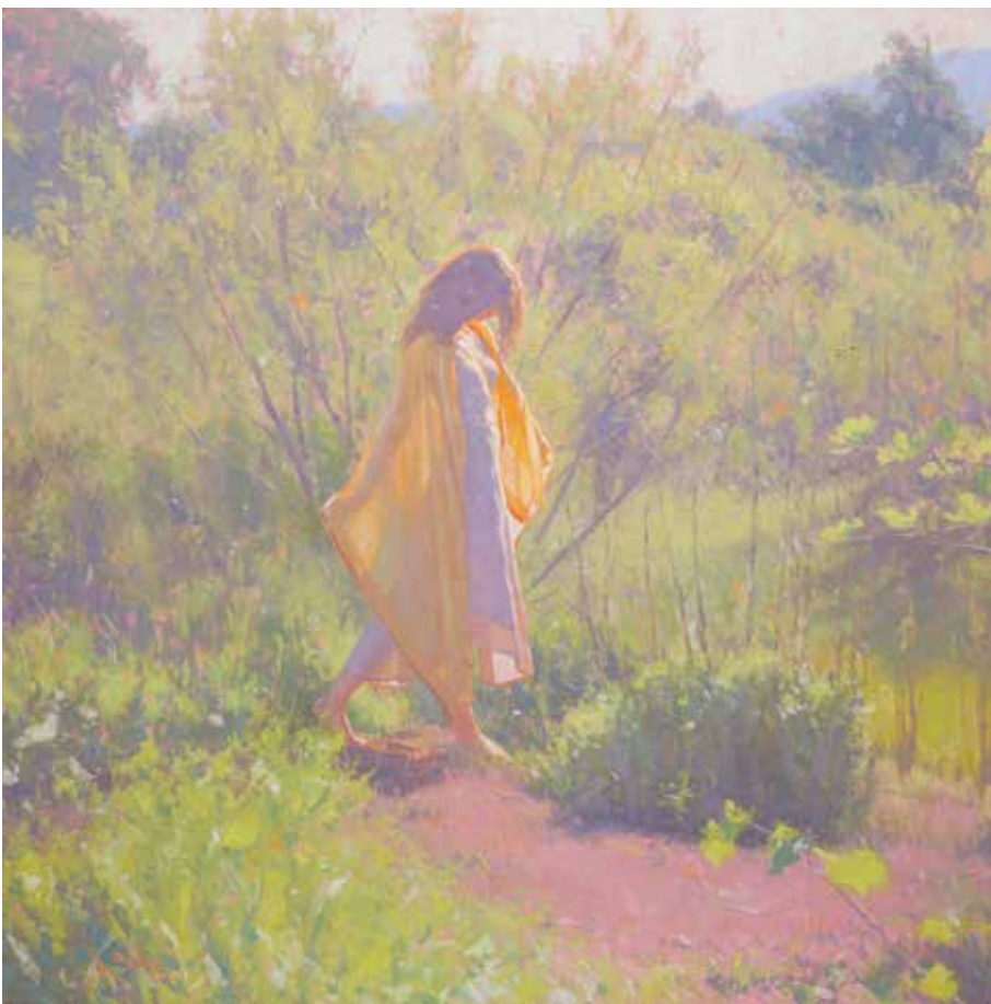
Wandering, oil, 30 x 30.