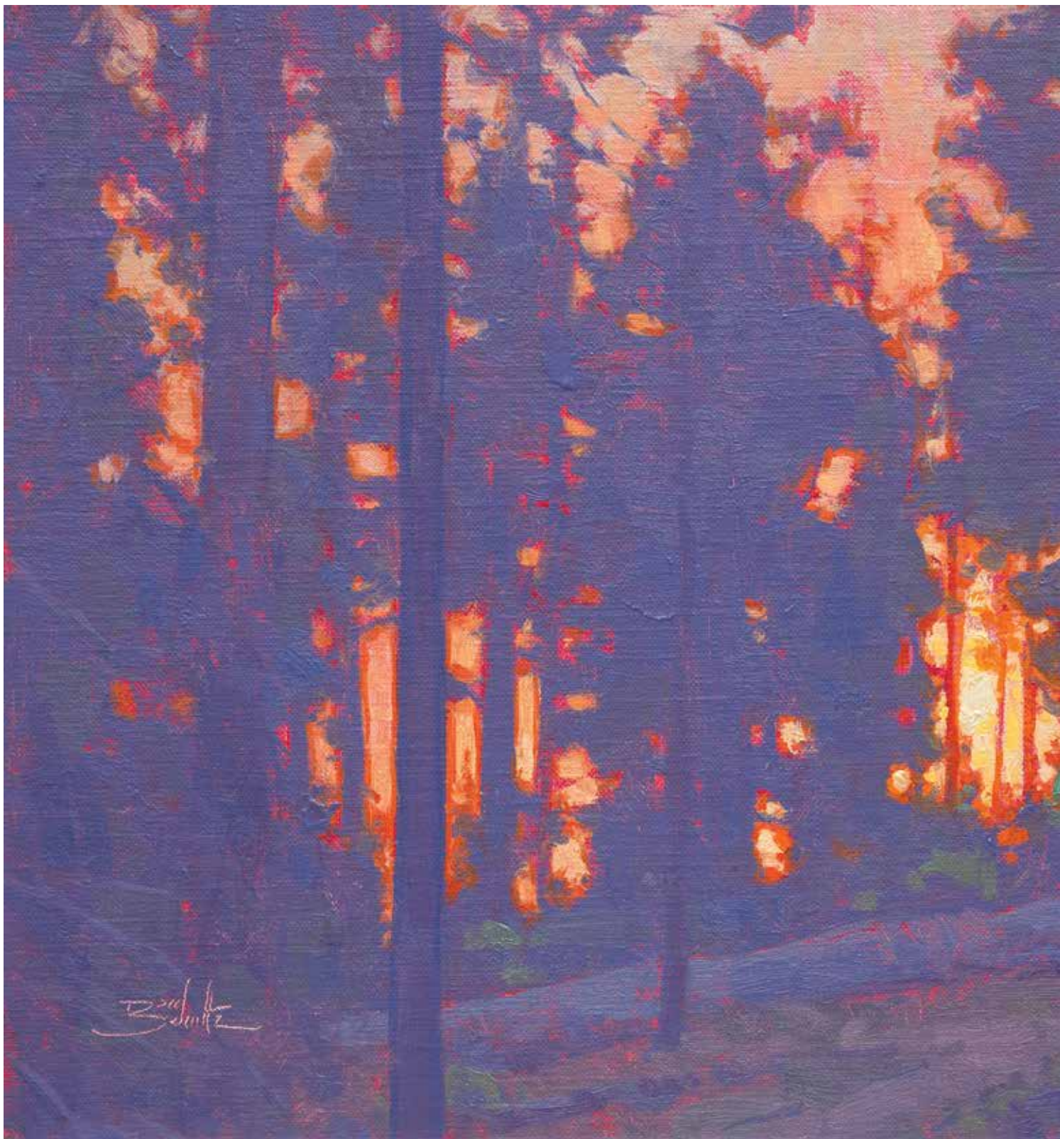
Forest Sunset, oil, 11 x 14.