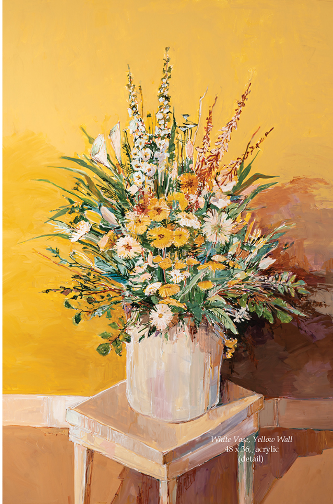
White Vase, Yellow Wall 48 x 36, acrylic (detail)