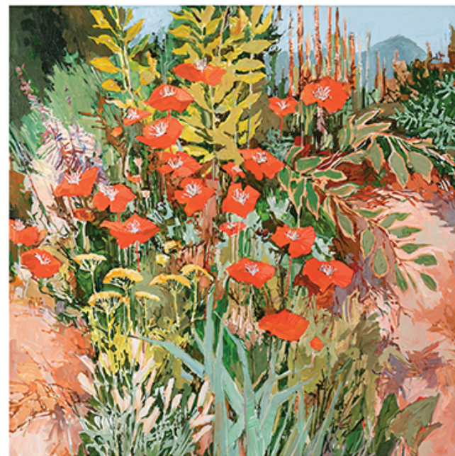
Poppies in Kitchen Garden VII , 24 x 24, acrylic