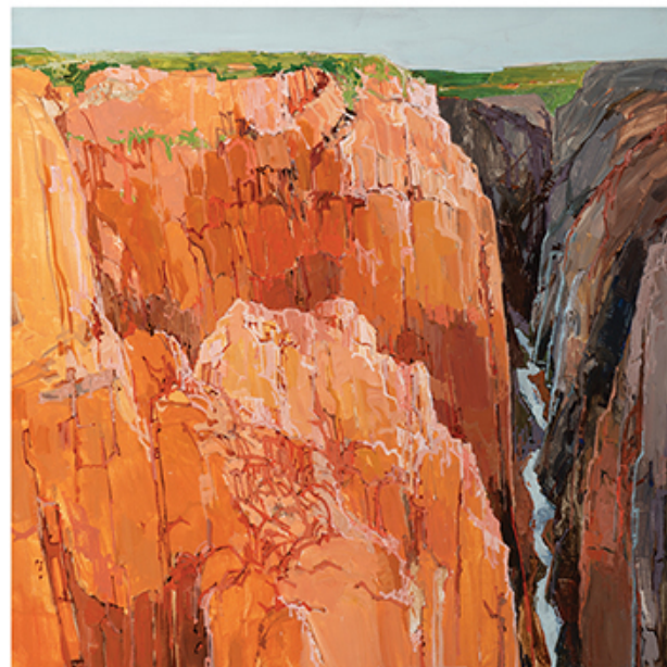
Black Canyon XI , 24 x 24, acrylic