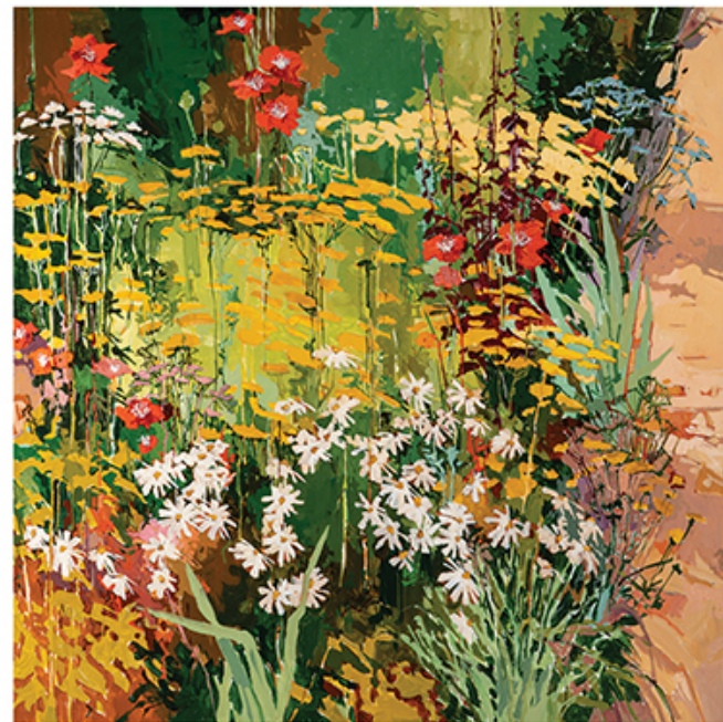
Summer Garden with Side Path , 34 x 34, acrylic