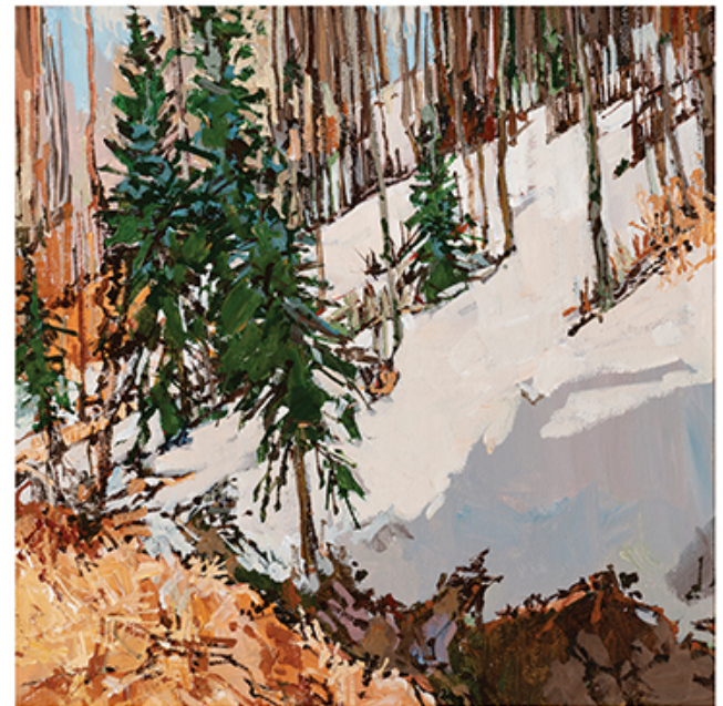
Hyde Park Snow, 12 x 12, acrylic