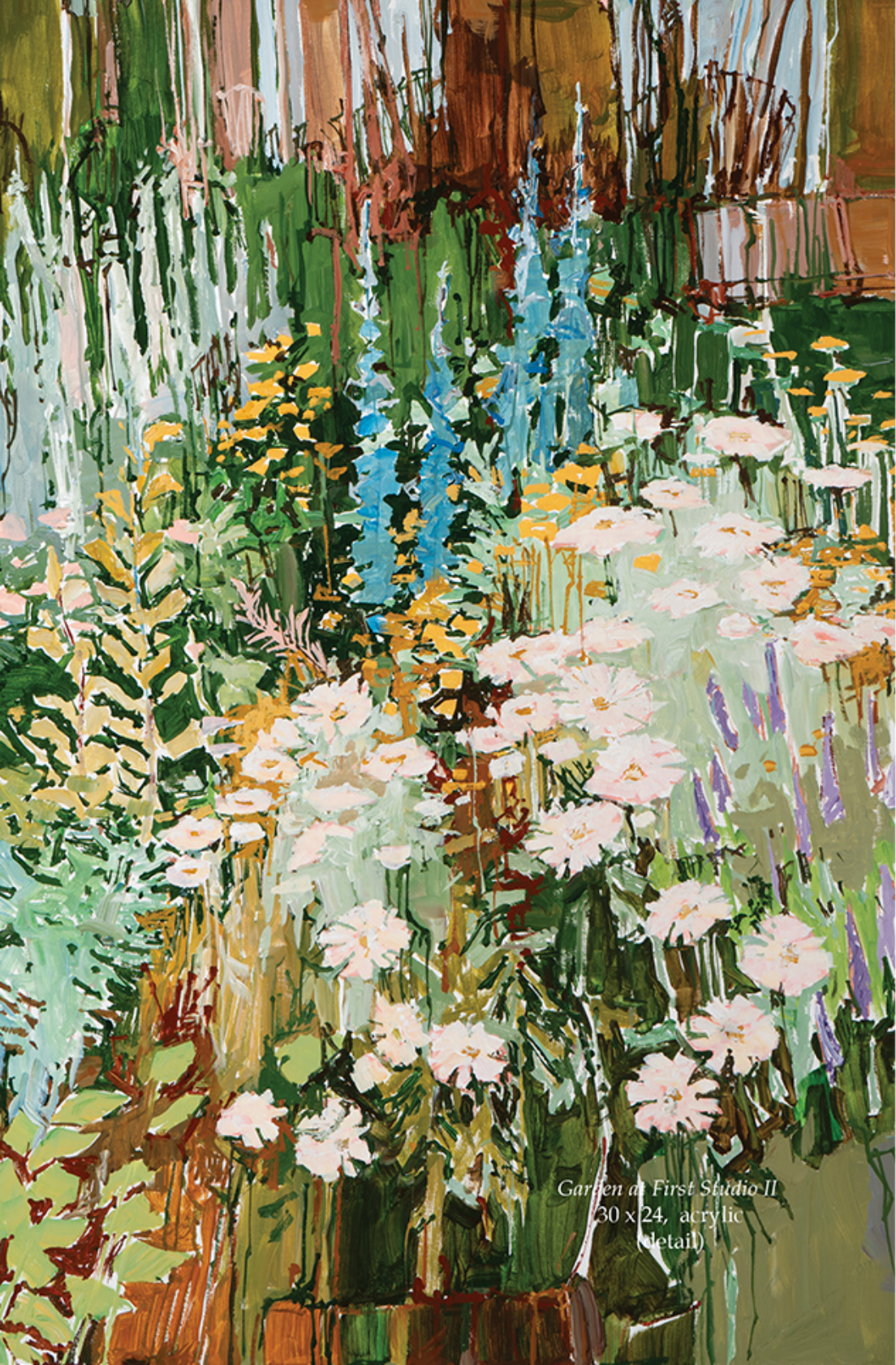
Garden at First Studio II 30 x 24, acrylic (detail)