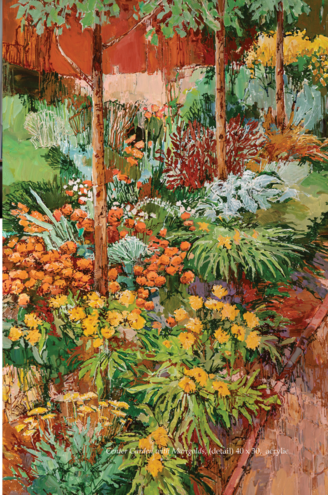
Center Garden with Marigolds, (detail) 40 x 30, acrylic

Bring the joy of summer into your home with one of these truly delightful paintings.