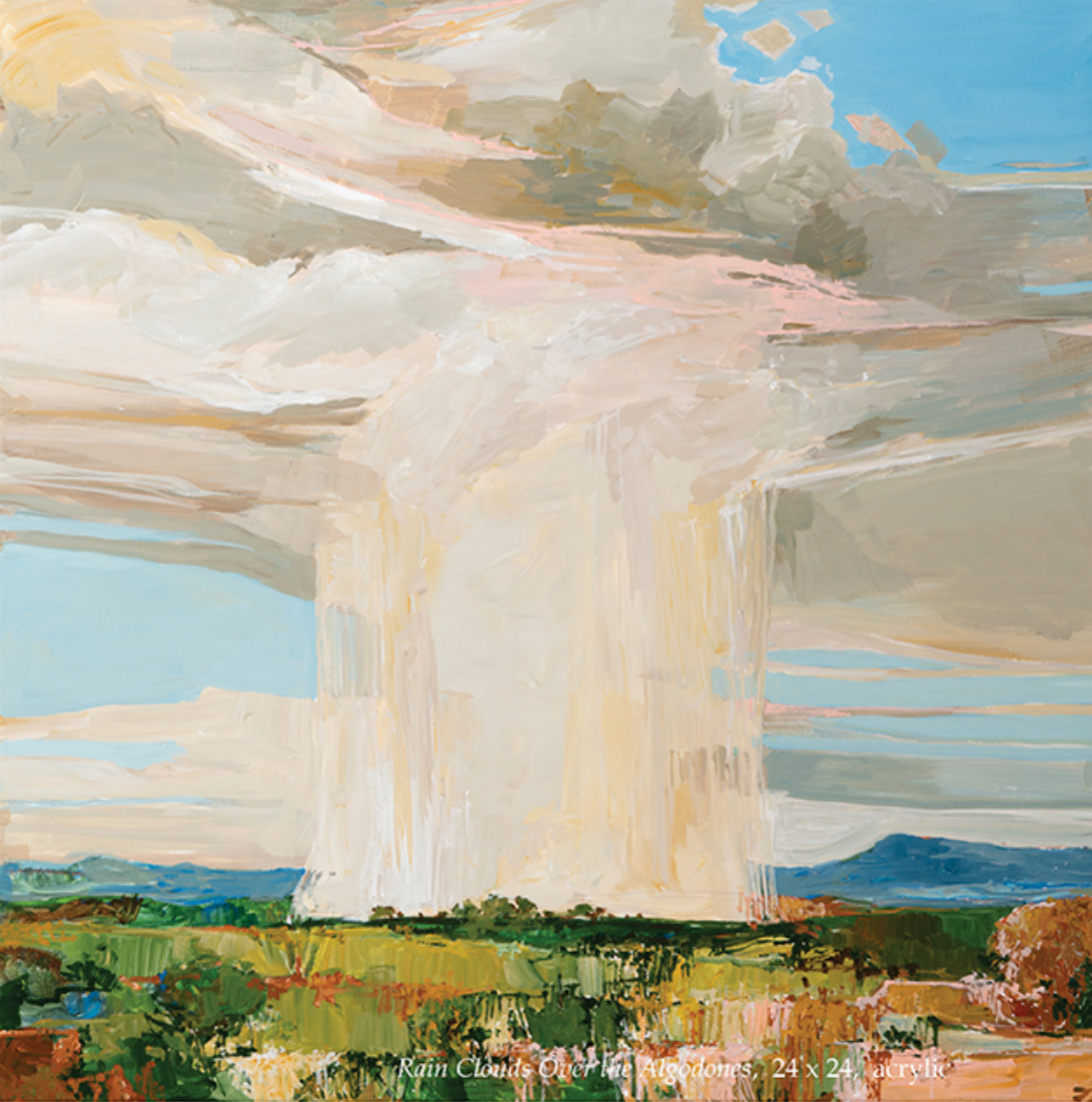
Rain Clouds Over the Algodones, 24 x 24, acrylic

"I generally do not want to paint scenes that seem improbable or very unlikely to occur in nature, even though they have. This one, however, delighted me, with the abundant wall of rainwater falling in a sunny sky. I thought the strands of rain were quite elegant, gossamer-like. The whiteness of the rain seemed purity itself, a benediction, in a dry landscape. Who am I to say what is improbable?"