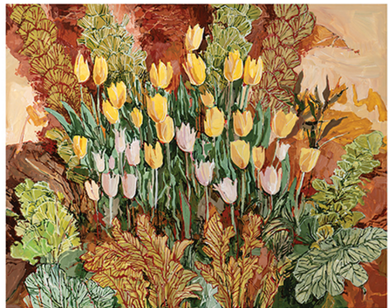
Mixed Tulips in the Vegetable Garden, 24 x 30 acrylic