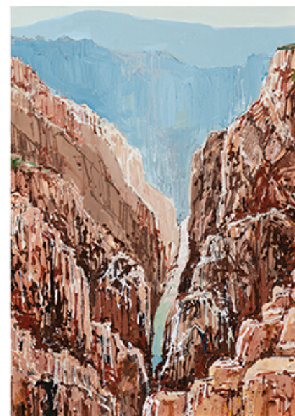
Black Canyon XVIII , 9 x 12, acrylic