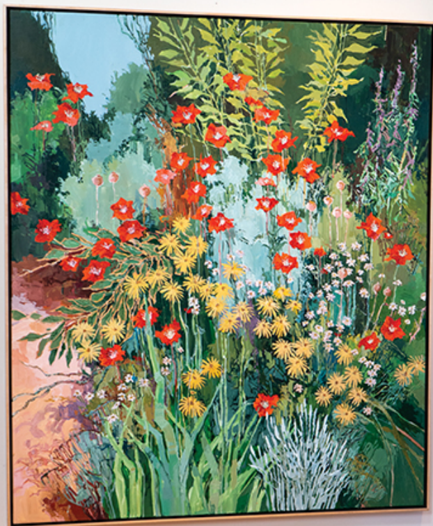
Kitchen Garden Poppies 56 x 46, acrylic