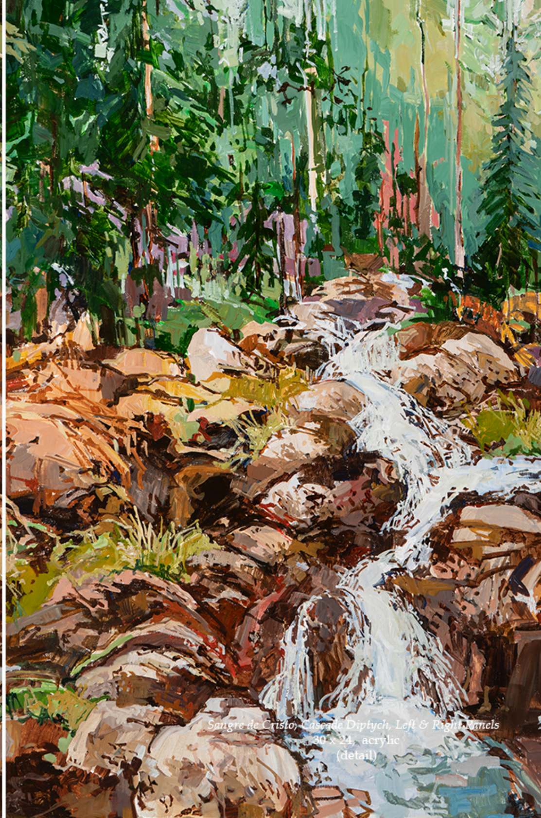
Sangre de Cristo, Cascade Diptych, Left & Right Panels 30 x 24, acrylic (detail)