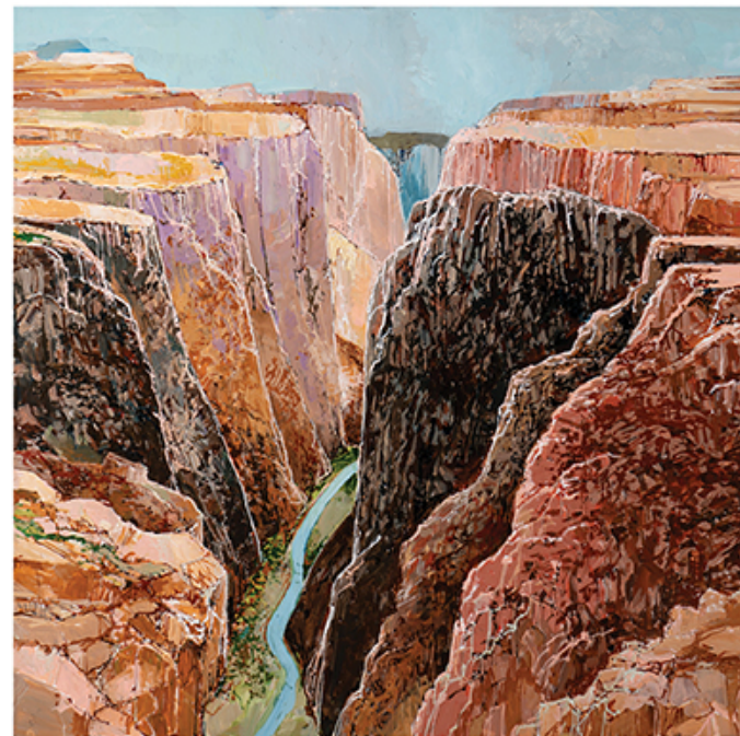
Black Canyon Summer IV , 36 x 36, acrylic