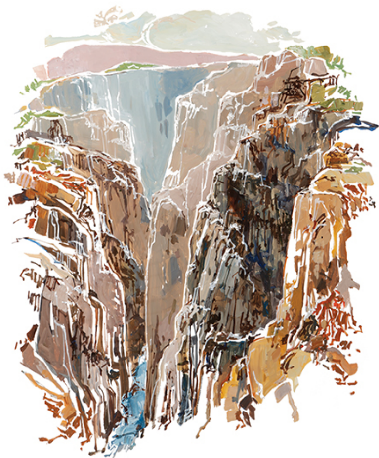
Black Canyon of the Gunnison XXVI 28.5 x 23, acrylic (on paper)

"If O'Keeffe said that the Pedernal Peak was hers after a hundred paintings, I should be able to claim the Black Canyon as mine. It never disappoints me as a brooding, ever-changing motif. It can be black as is its eponymous right, but also earth-red and raw sienna, even pale yellow in the full, overhead sun. The far reaches of the canyon turn to pale blues and violets. And in the bottom folds, there is always the greenish-blue of the waters. That moist heart is a perfect foil for the sere dark cliff-sides."