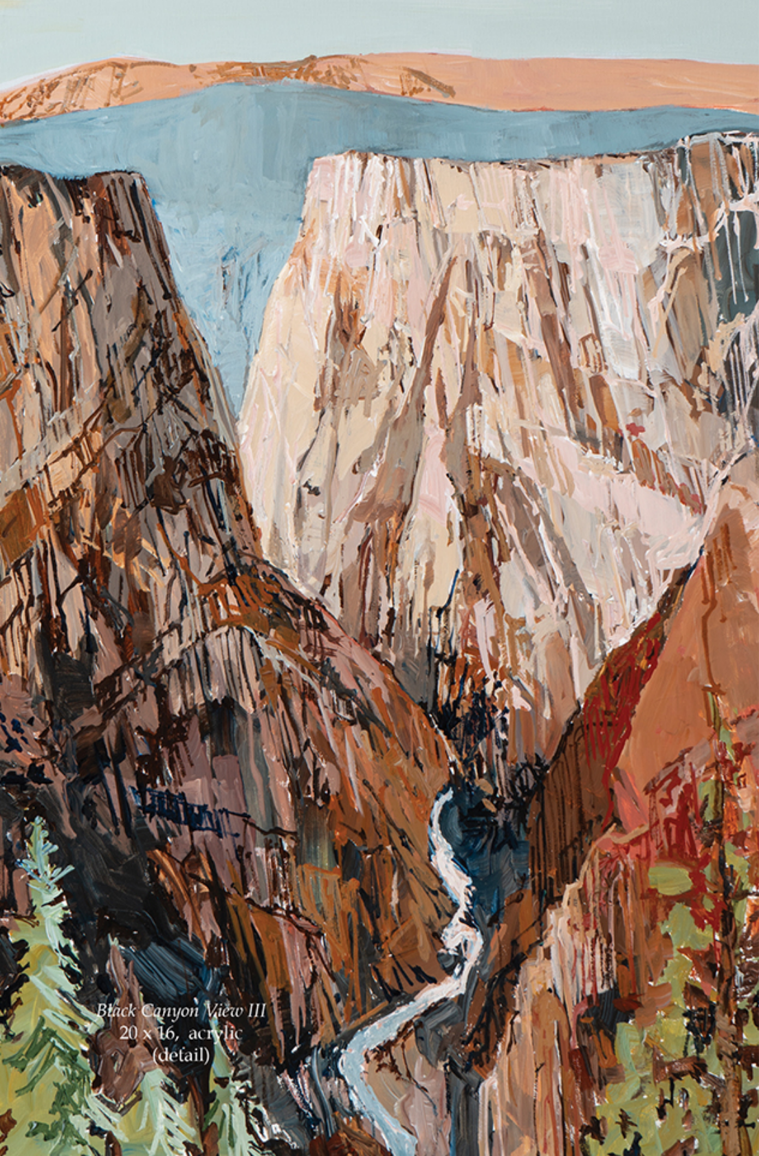
Black Canyon View III 20 x 16, acrylic (detail)