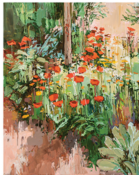
Yarrow + Poppies on West Drive , 20 x 16, acrylic