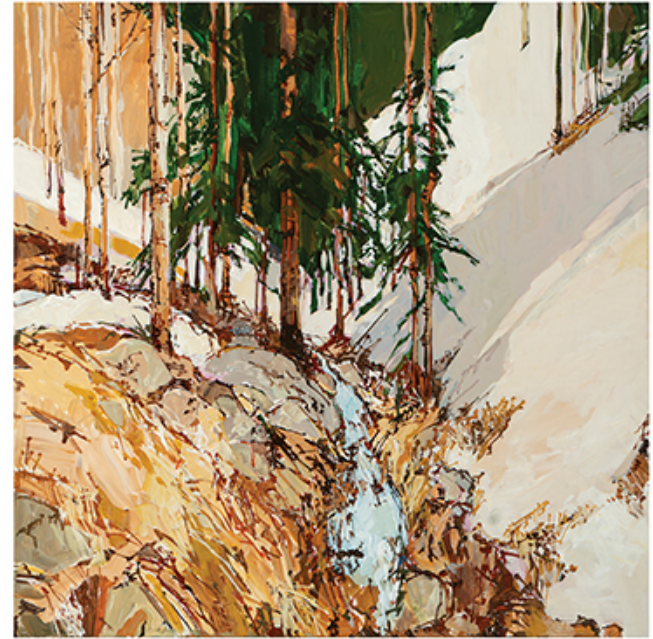
Snow on the Sangre de Cristos, 20 x 20, acrylic