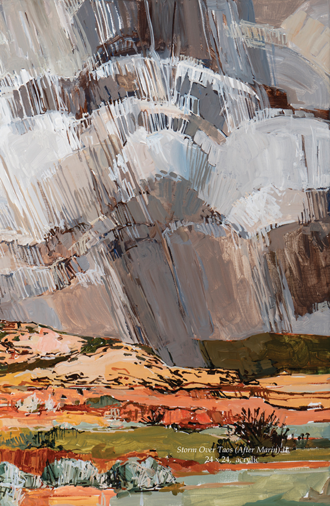
Storm Over Taos (After Marin) II 24 x 24, acrylic

"There is something right about leaving the residence in the morning, traveling at least some distance to your place of work. Your mindset changes, no longer worried about kitchen dishes or rings in the bathtub. You are now in the studio, where matters of painting fill the mind. Gone is the quotidian world. And now it is time to get to work at the easel."