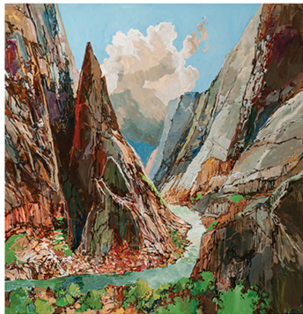
Black Canyon Summer II , 30 x 30, acrylic