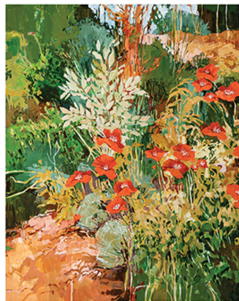
Canyon Road Walled Garden , 30 x 24, acrylic