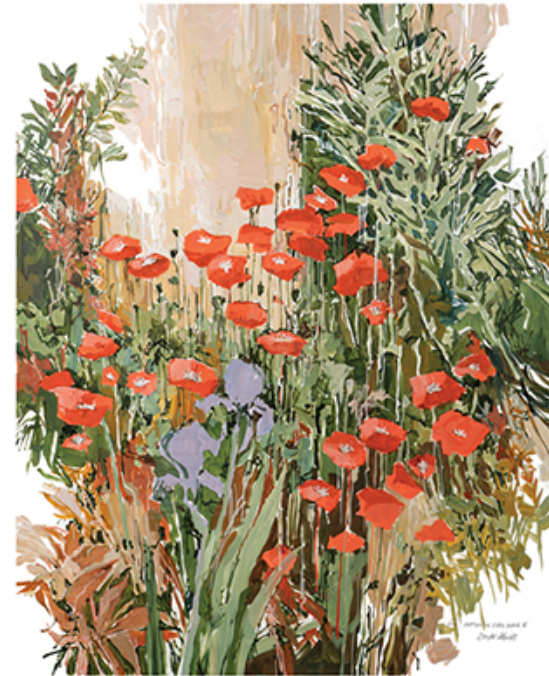
Poppies on the Studio Walk II 28.5 x 23, acrylic (on paper)