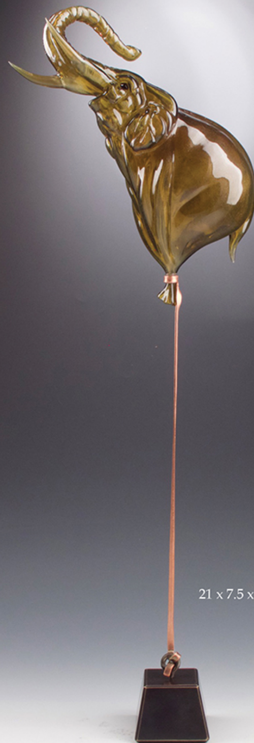
Chris Ahalt Dreamer 21 x 7.5 x 3.5, blown glass