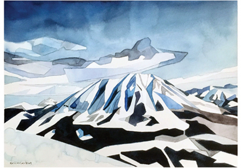
Becca Seifert Clouds Over Gothic , 9 x 12, watercolor