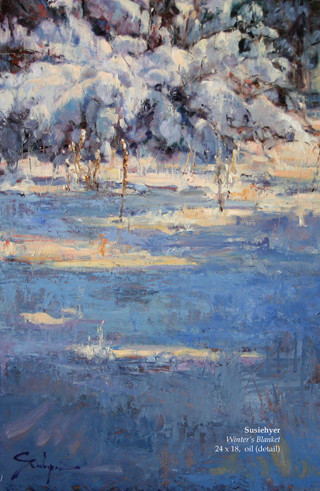
Susiehyer Winter's Blanket 24 x 18, oil (detail)