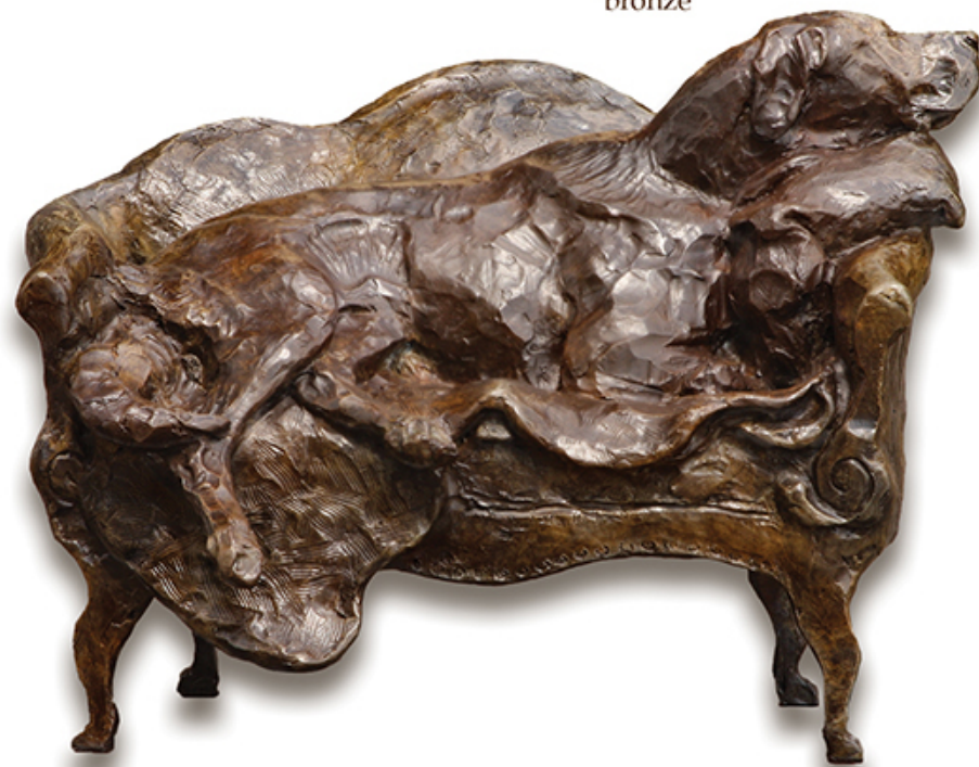
George Bumann Home Alone 11.25 x 7.5 x 8.5 bronze