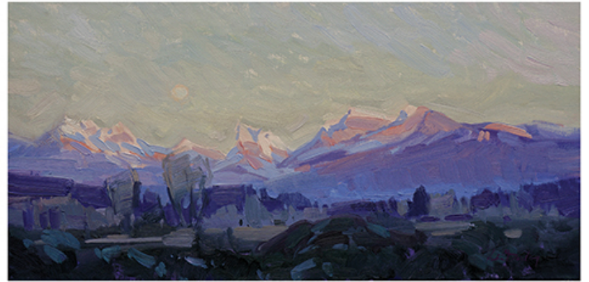
Katie Dowling Moonrise , 10 x 20, oil