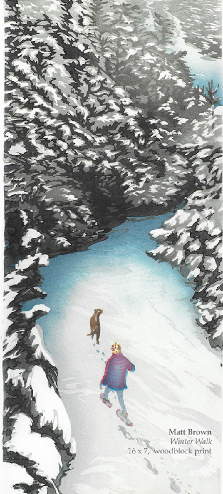
Matt Brown Winter Walk 16 x 7, woodblock print