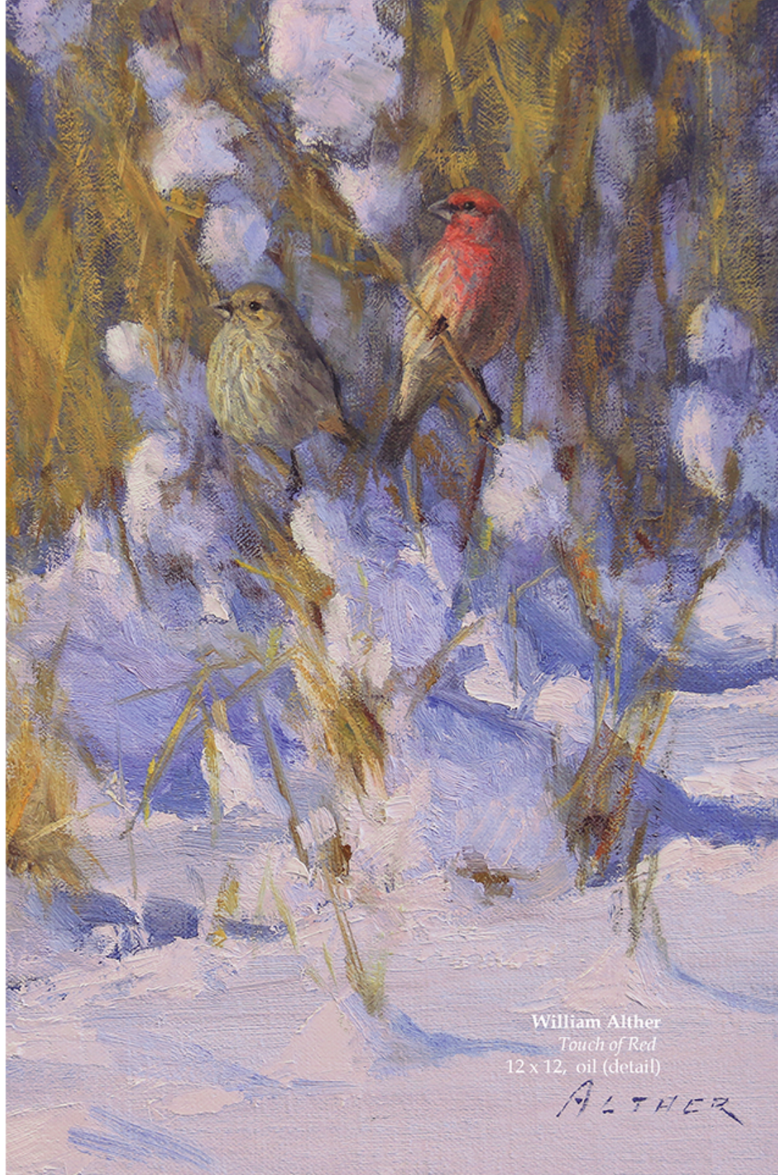
William Alther Touch of Red 12 x 12, oil (detail)