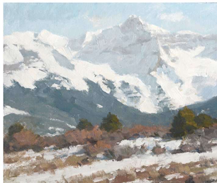
Ralph Oberg Winter on the Divide , 10 x 12, oil