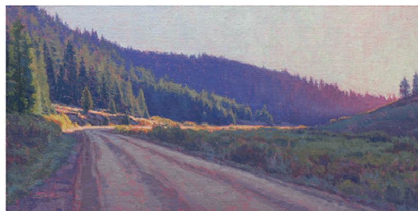
Dan Schultz End of Day , 12 x 24, oil