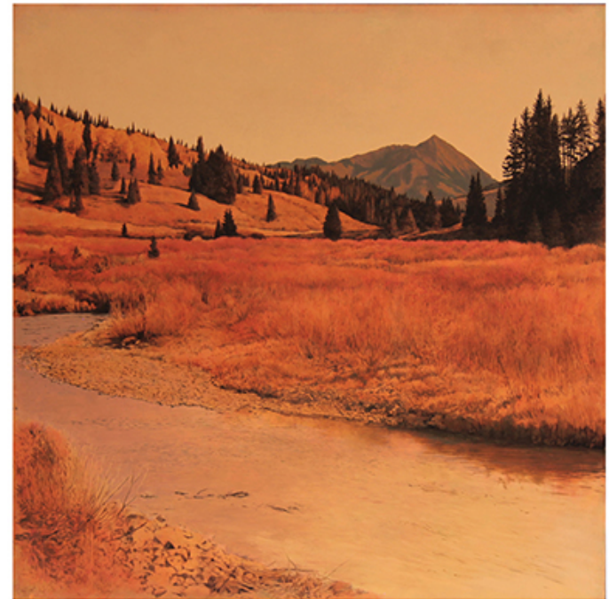
Erick Ingraham East River , 24 x 24, oil