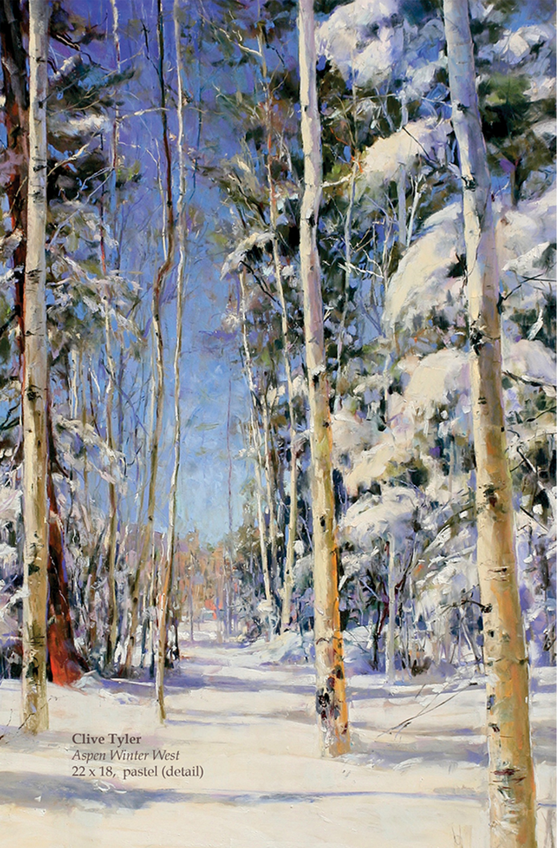
Clive Tyler Aspen Winter West 22 x 18, pastel (detail)