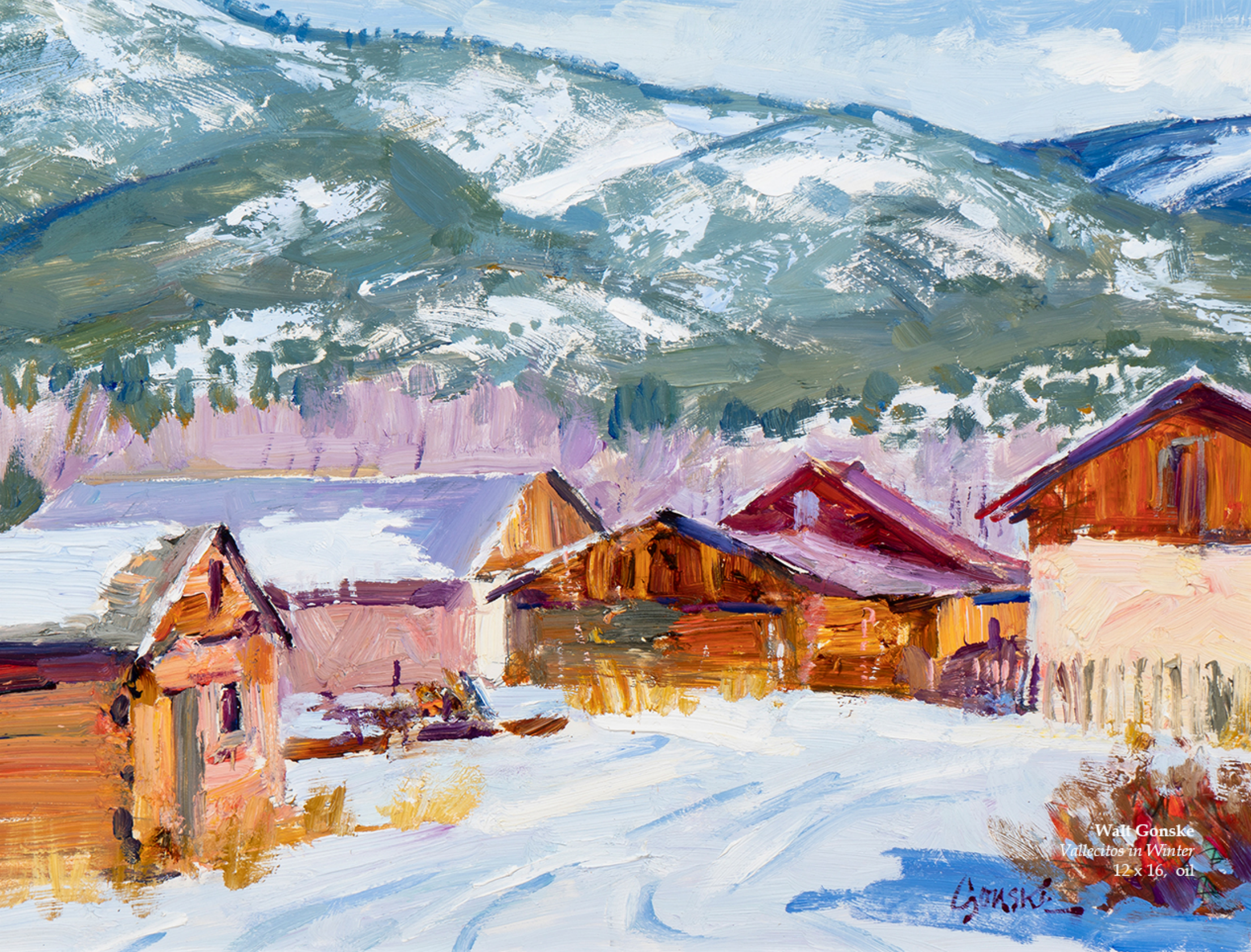
Walt Gonske Vallecitos in Winter 12 x 16, oil