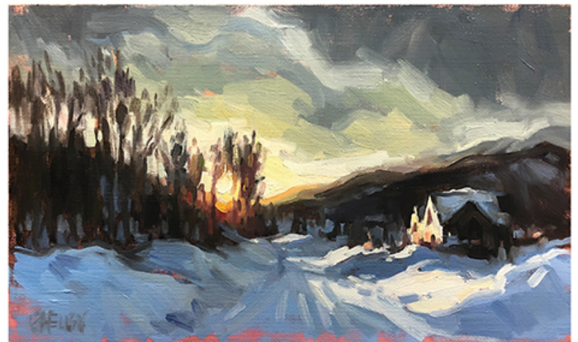
Shelby Keefe Last Minute Breakthrough , 8 x 13, oil