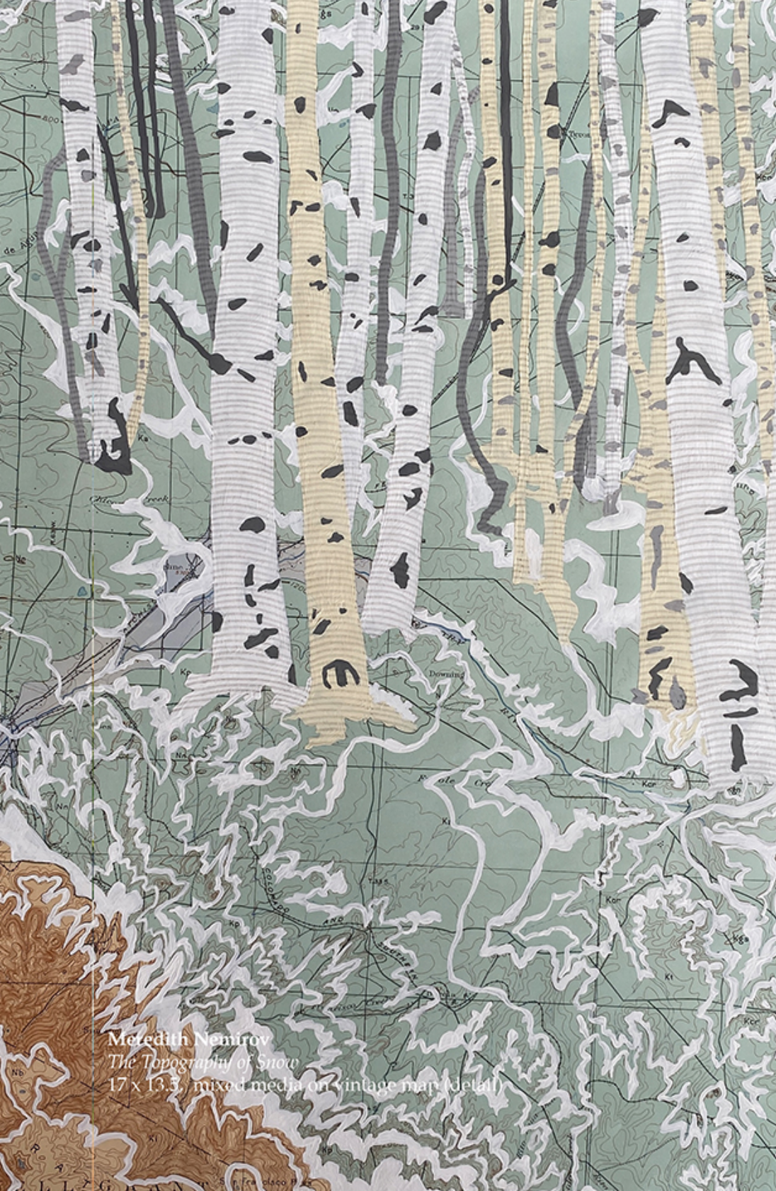
Meredith Nemirov The Topography of Snow 17 x 13.5 mixed media on vintage map (detail)