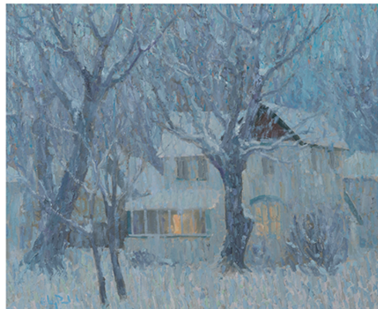
Gregory Packard Snow , 24 x 30, oil