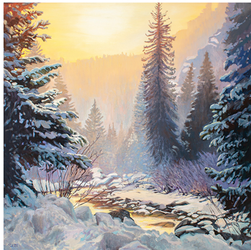
Nicholas Reti Winter on the Taylor , 22 x 22, oil

Tim Deibler First Light of Dawn , 9 x 12, oil (above) Leon Loughridge Ten Mile Range , 18 x 12, woodblock print (front cover) Jim Wodark Fall Song , 12 x 28, oil (triptych, back cover)