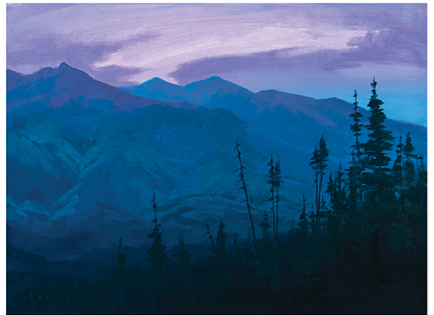
Lucius Welch Gothic Saddle , 9 x 12, oil