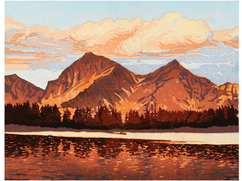
Nicholas Reti What Dreams May Come , 6 x 8, linoleum block print