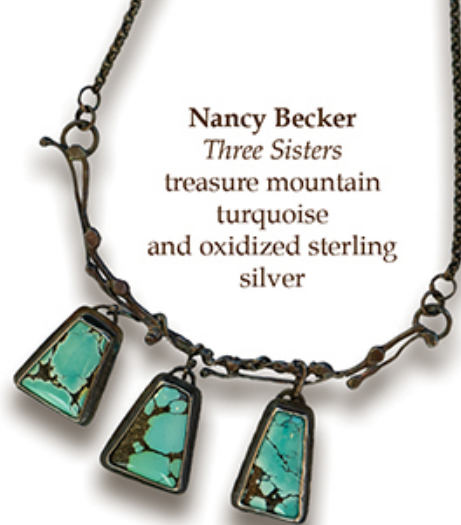
Nancy Becker Three Sisters treasure mountain turquoise and oxidized sterling silver