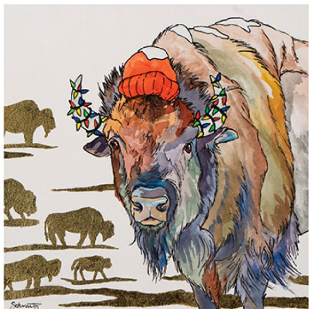
Tracy Schwartz Where's Your Holiday Spirit? 6 x 6, watercolor, ink, gold leaf