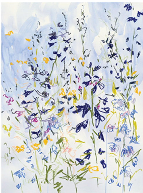
Ivy Kim Penstemon Morning , 30 x 20, acrylic and pastel