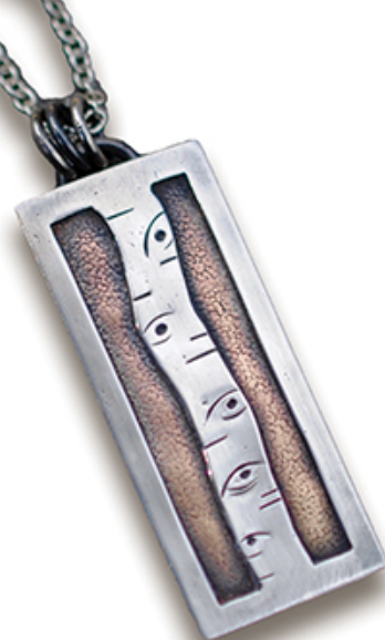
Gothic Mountain Jewelers Autumn Aspen Necklace sterling silver and brass