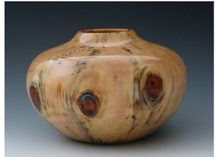
William Folger Norfolk Island Pine with 7 Knots , 7.75 x 5.25, woodturning