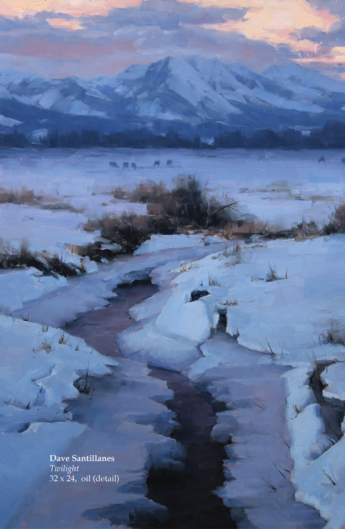
Dave Santillanes Twilight 32 x 24, oil (detail)