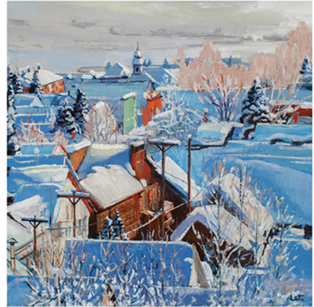
Nicholas Reti Rooftops in Snow , 12 x 12, oil