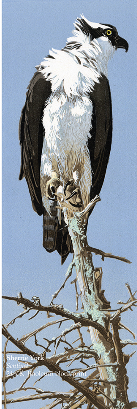
Sherrie York Sentinel 24 x 8, linoleum block print