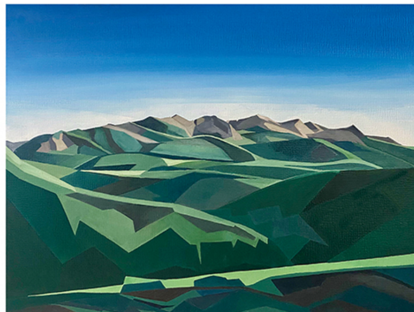
Becca Seifert Anthracites - June , 9 x 12, oil