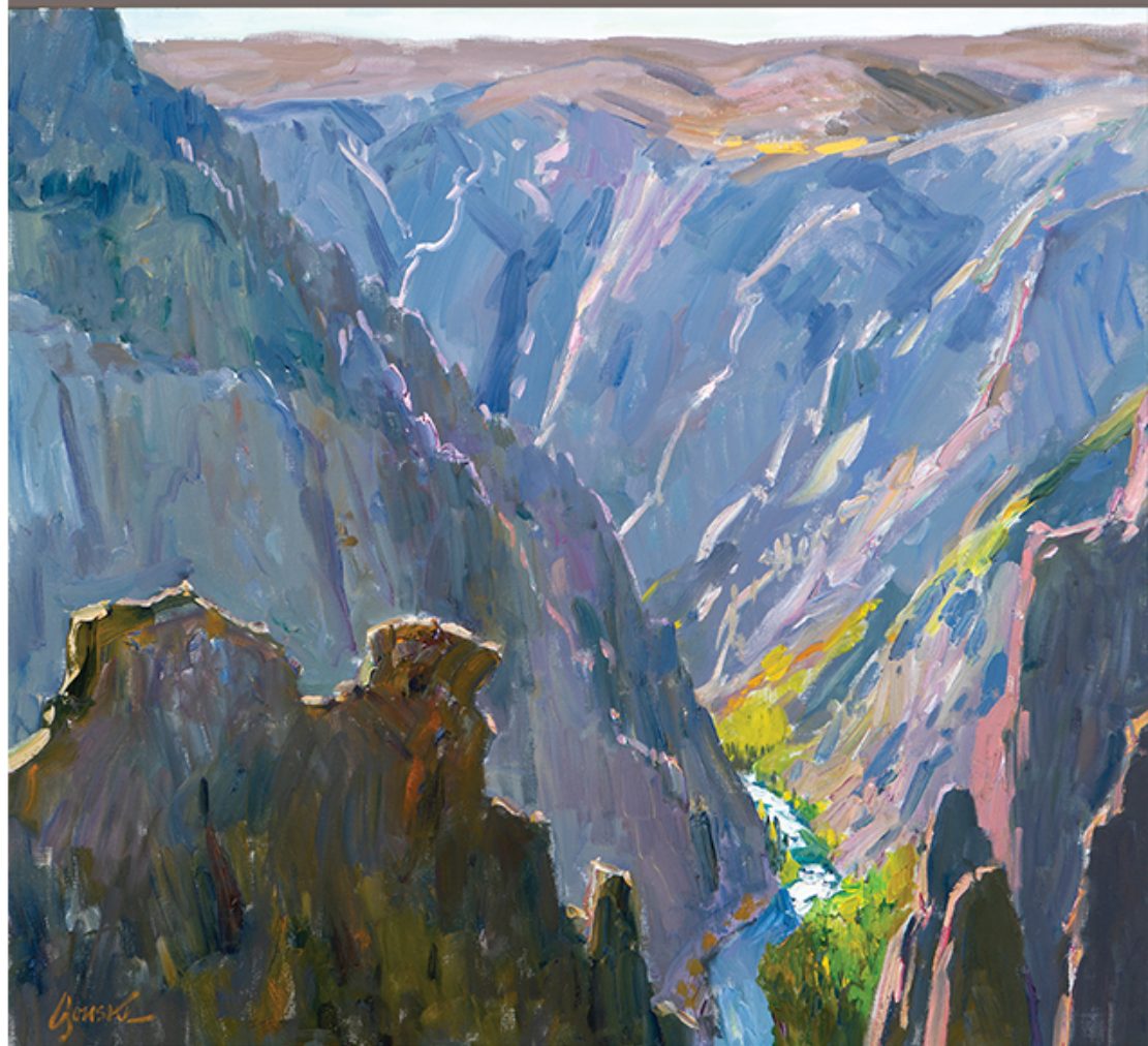
Walt Gonske The North Rim at Kneeling Camel Rock , 30 x 34, oil