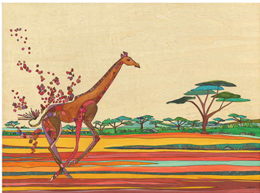
Katherine Homes Fleeing Giraffe 12 x 16, ink & watercolor on birch