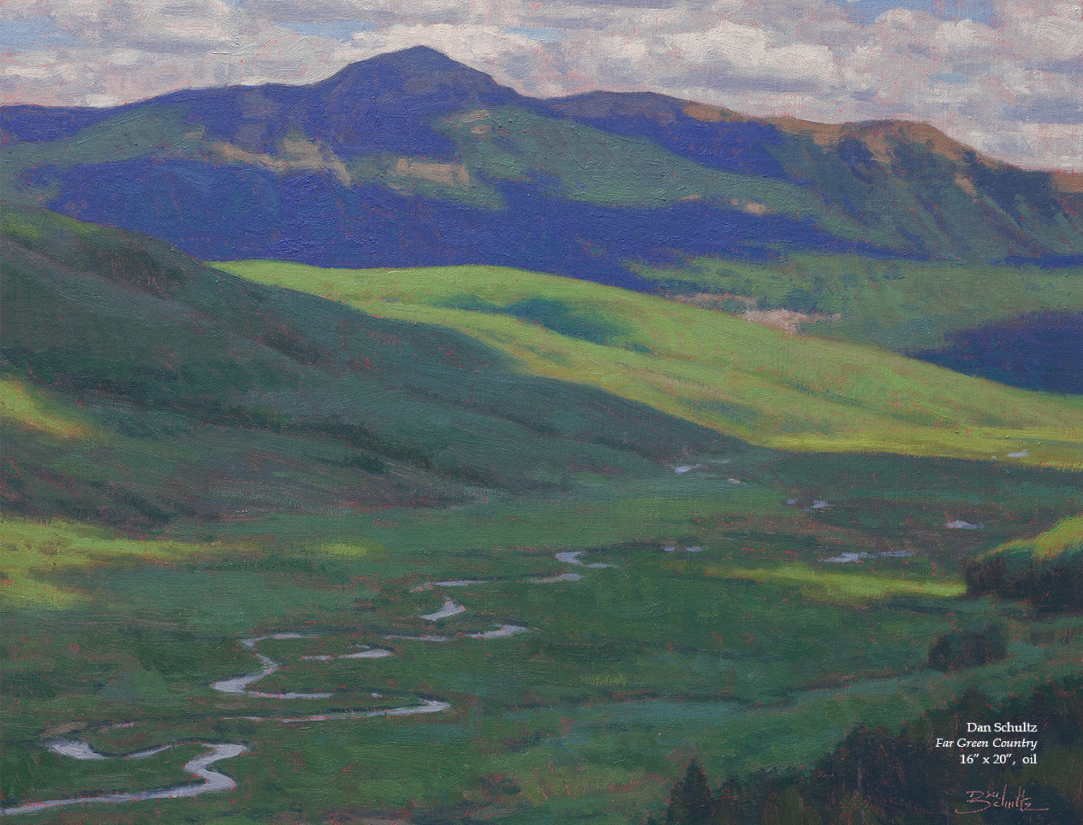
Dan Schultz Far Green Country 16" x 20", oil