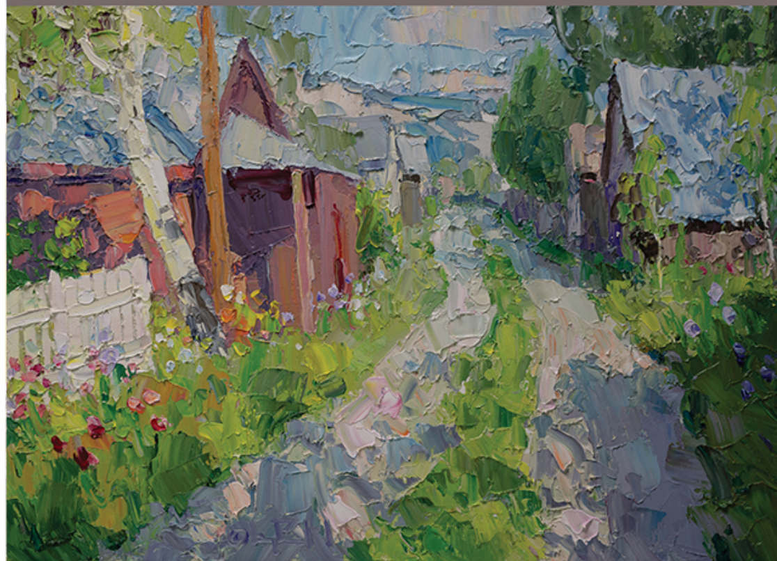
Gregory Packard Crested Butte Charm , 14 x 20, oil