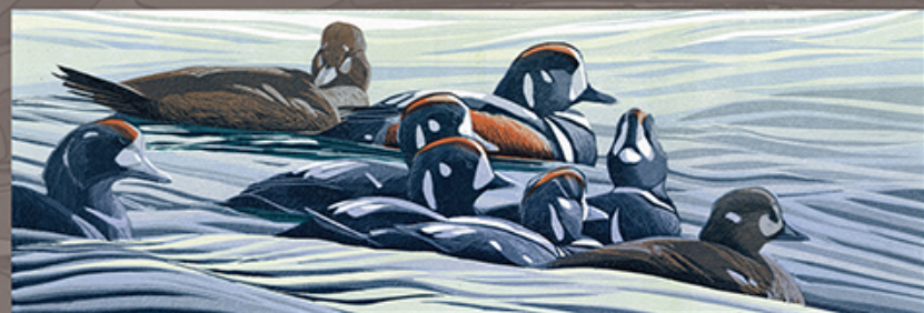
Sherrie York Swell Gathering , 8 x 24, linoleum block print

TREE INTERPRETATIONS FT. MEREDITH NEMIROV SEPTEMBER 2 - 20