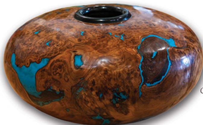
William Folger Cottonwood Burl & Turquoise 7.75 x 4.25, woodturning