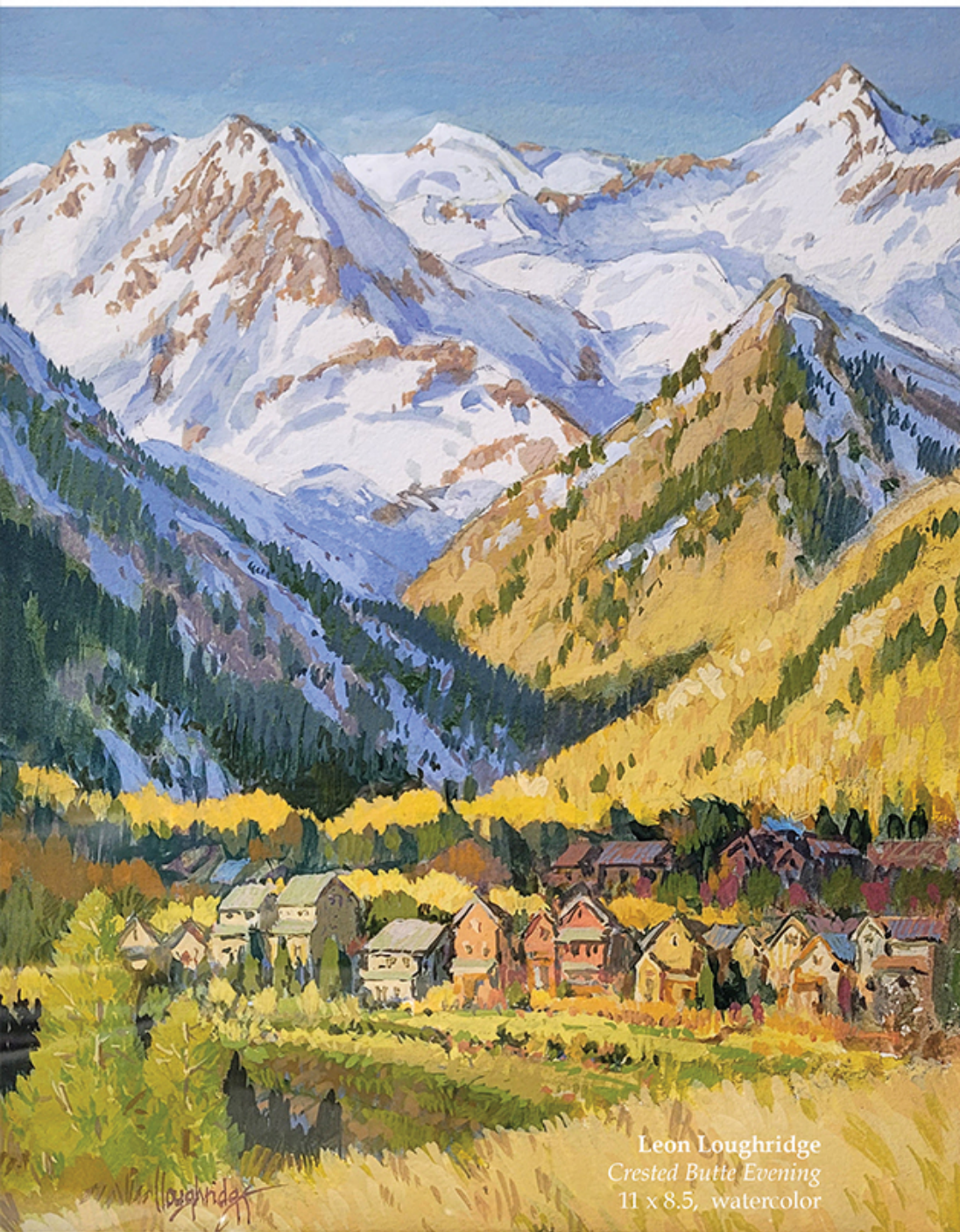
Leon Loughridge Crested Butte Evening 11 x 8.5, watercolor