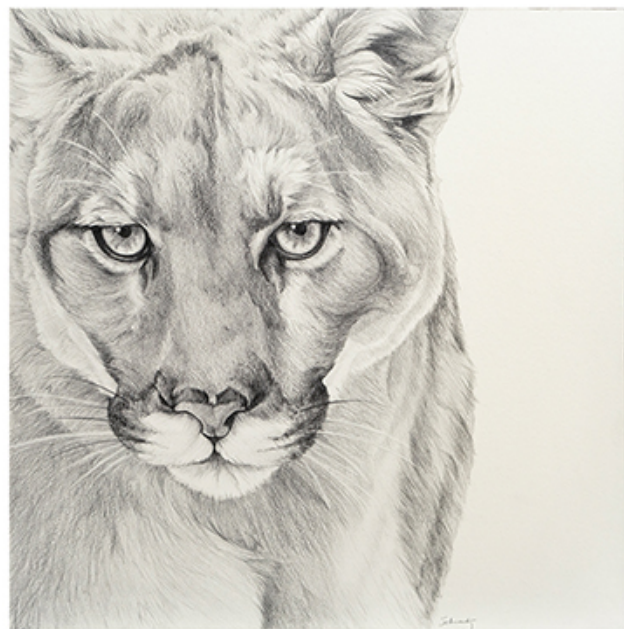
Tracy Schwartz Austerity - Mountain Lion No.1 , 12 x 12, pencil