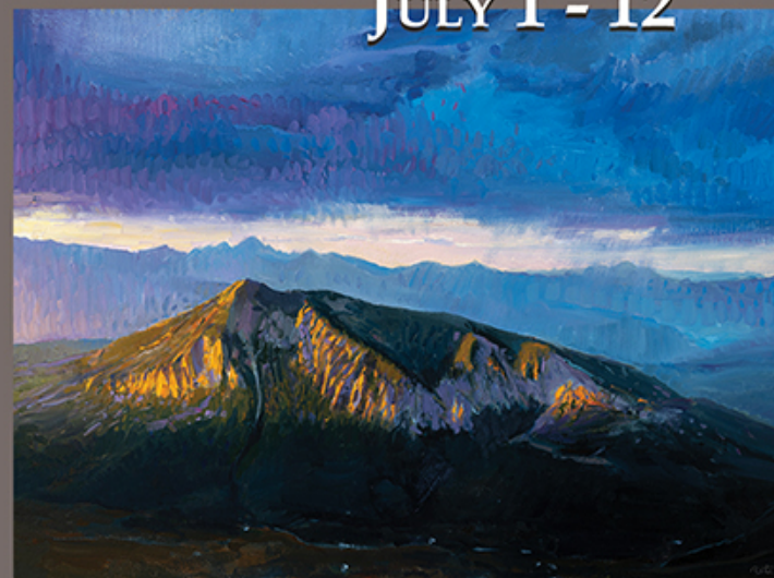
Nicholas Reti Summer's Ascent , 14 x 18, oil (top) Nicholas Reti Mother Rock , 18 x 24, oil (bottom)