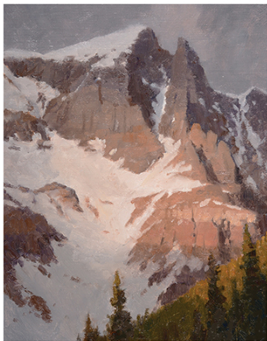
Ralph Oberg Sheep Mountain, Study , 18 x 14, oil