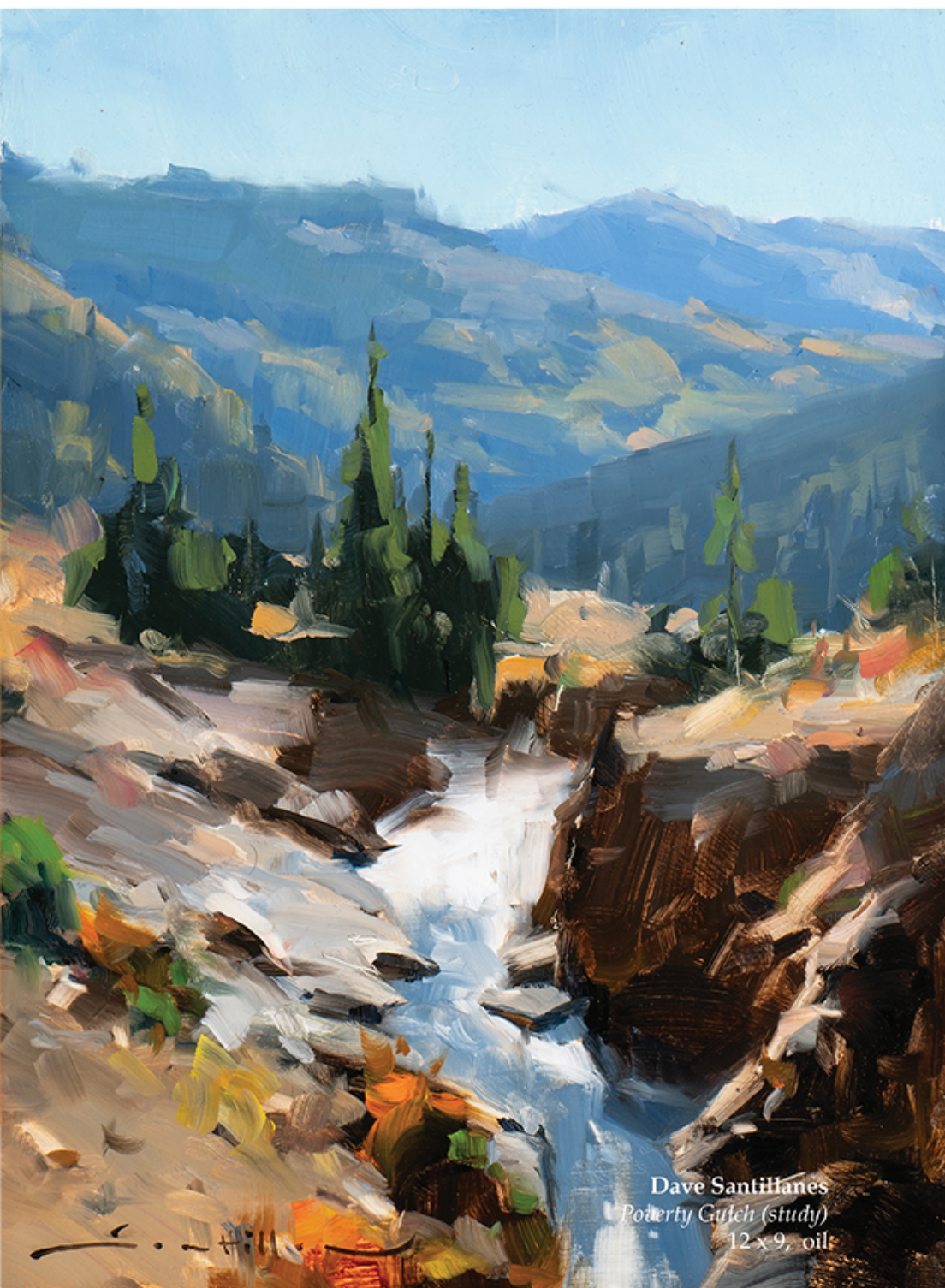
Dave Santillanes Poverty Gulch (study) 12 x 9, oil