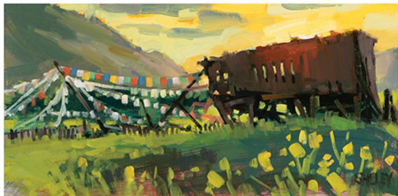
Shelby Keefe Prayers on the Wind , 8 x 16, oil