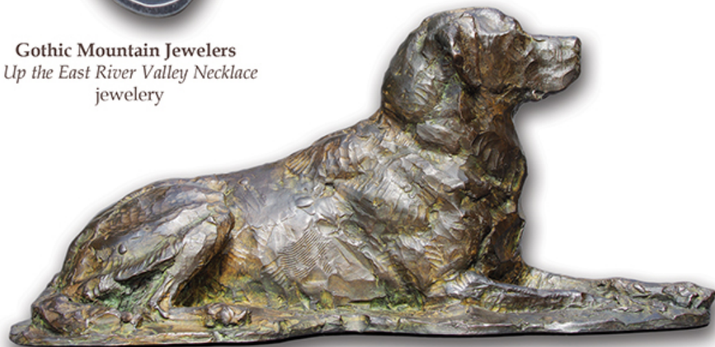
George Bumann Labrador Sphinx , 13 x 5.25 x 6.25, bronze