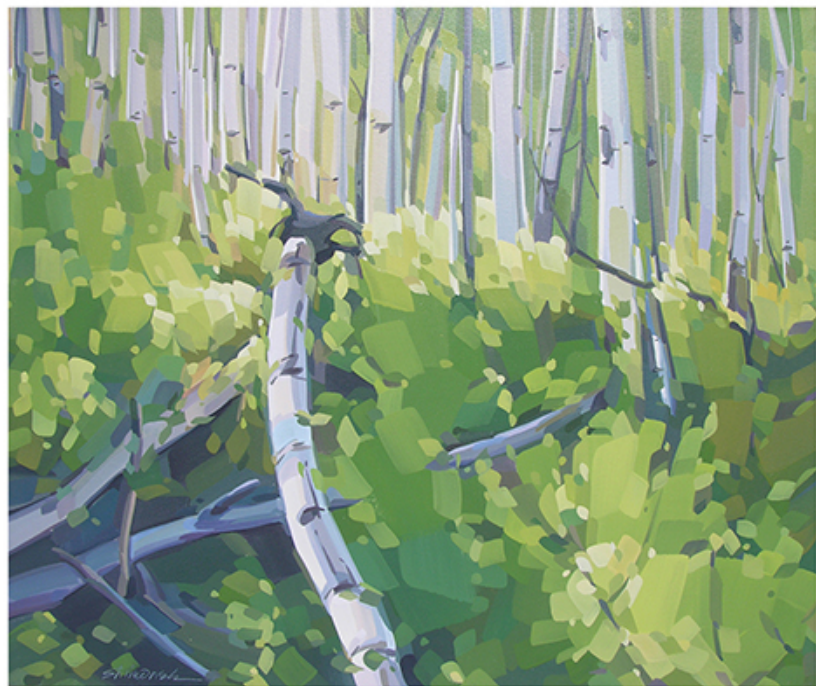
Mick Shimonek Court Jester , 26 x 31, oil