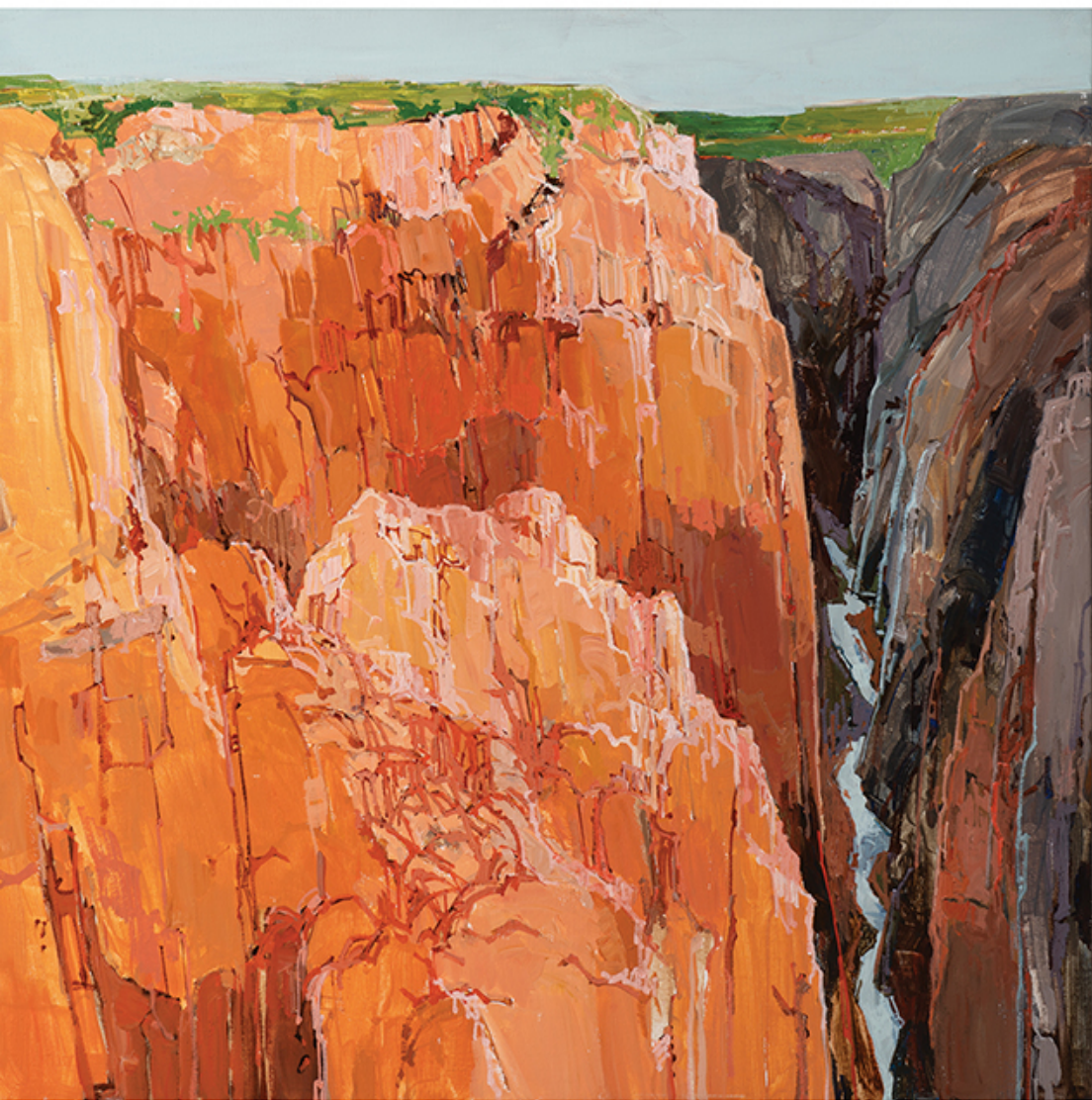
Douglas Atwill Black Canyon XI , 24 x 24, acrylic