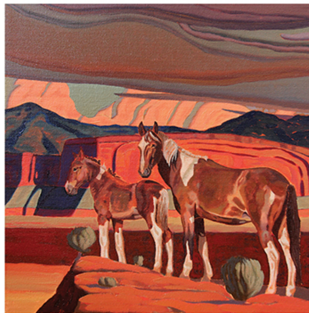
Taylor Crisp The Painted Desert , 12 x 12, oil