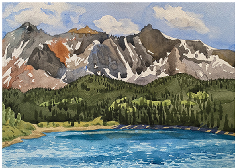
Meredith Nemirov Lake, Early Summer , 10 x 14, watercolor