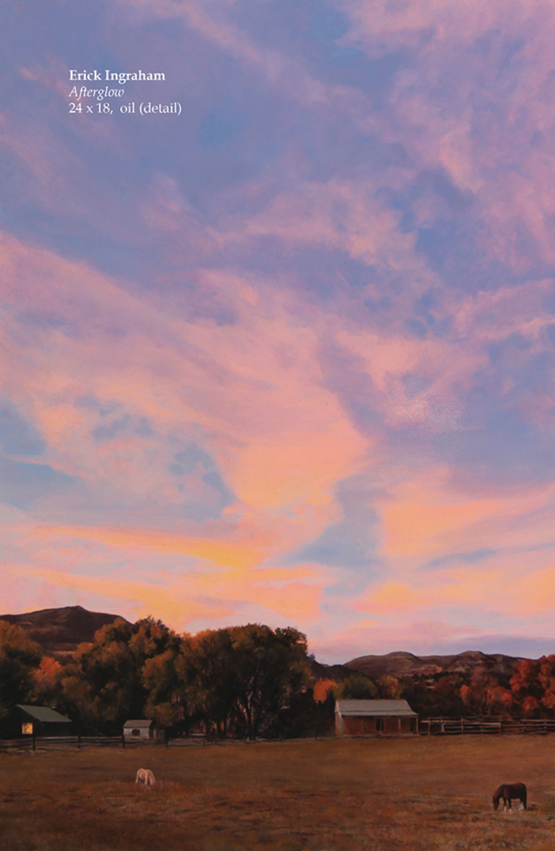
Erick Ingraham Afterglow 24 x 18, oil (detail)