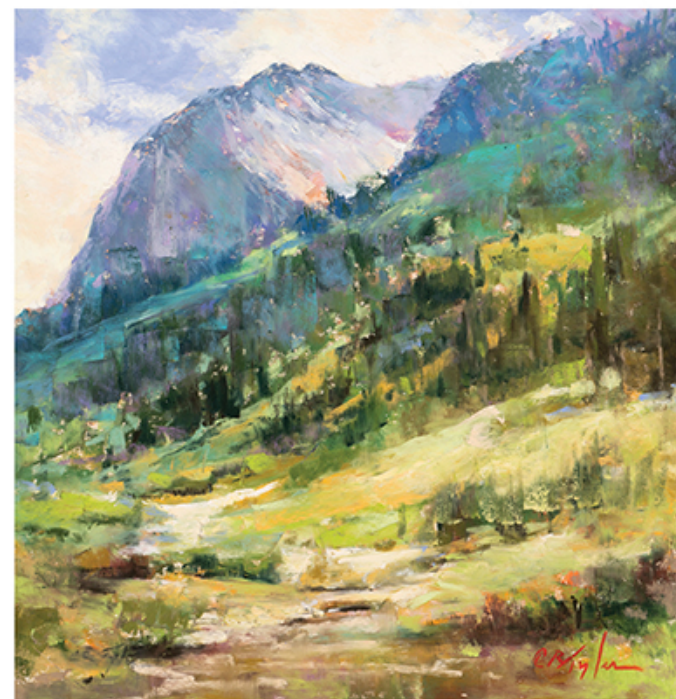
Clive Tyler Crested Butte Vista , 12 x 12, pastel