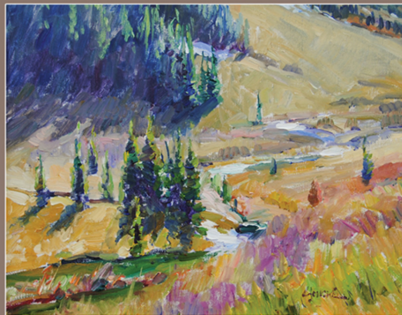
On Coal Creek 16 x 20, oil