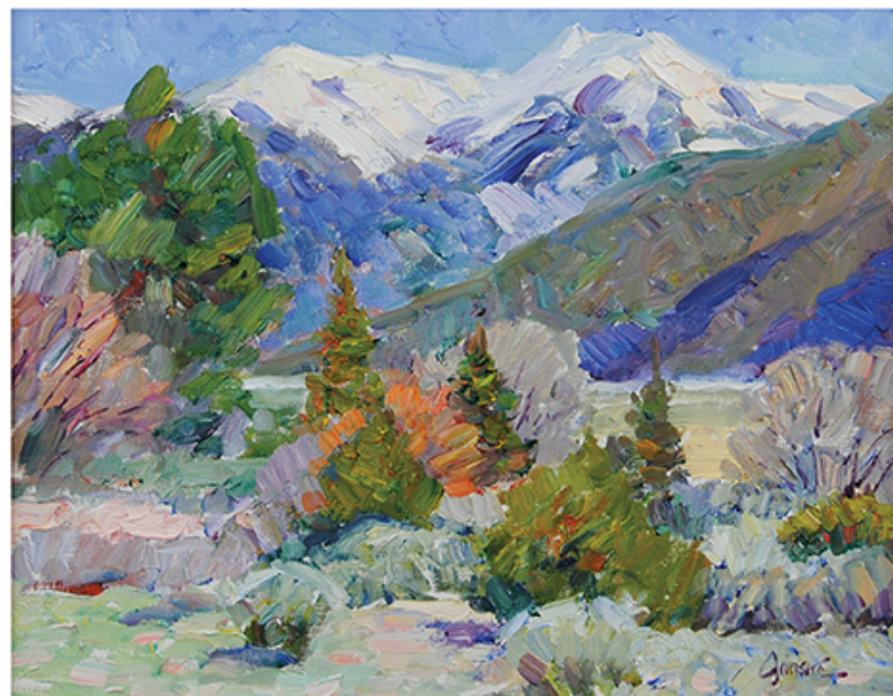
Mid April in Taos, 16 x 20, oil