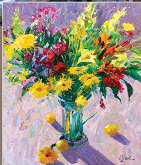
A Summer Morning, 28 x 24, oil

"The end result is not about that first idea, but instead a record of all those impulses along the way. Each stroke of paint carries emotion and power. I work in a loose, painterly style in part because I want the viewer to see the process and not hide it behind 'finish' - for the viewer to maybe even feel how a particular piece of paint was put down. My goal is not to show what I know, but what I feel."