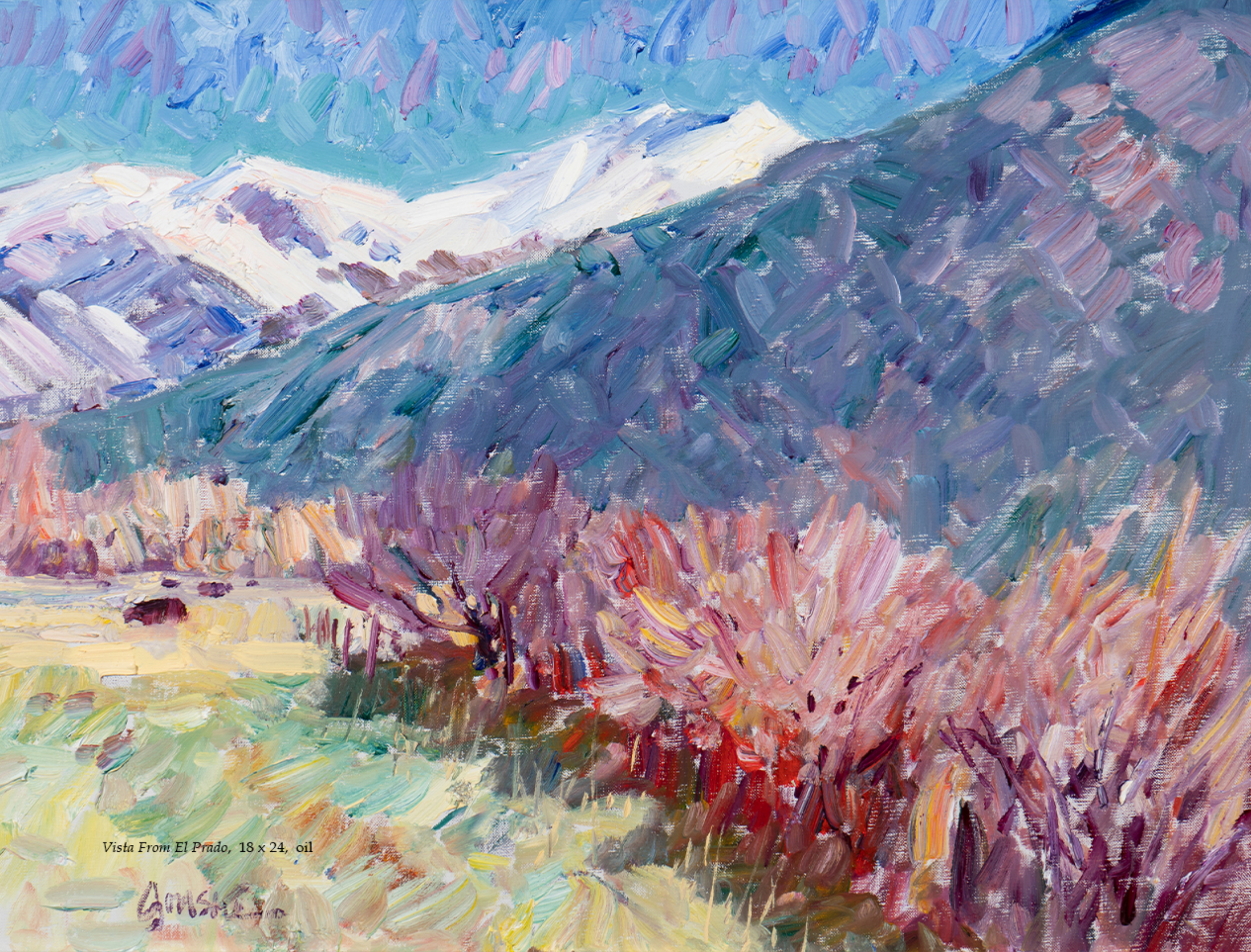
Vista From El Prado, 18 x 24, oil