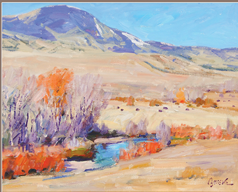
Late in the Fall, 14 x 18, oil