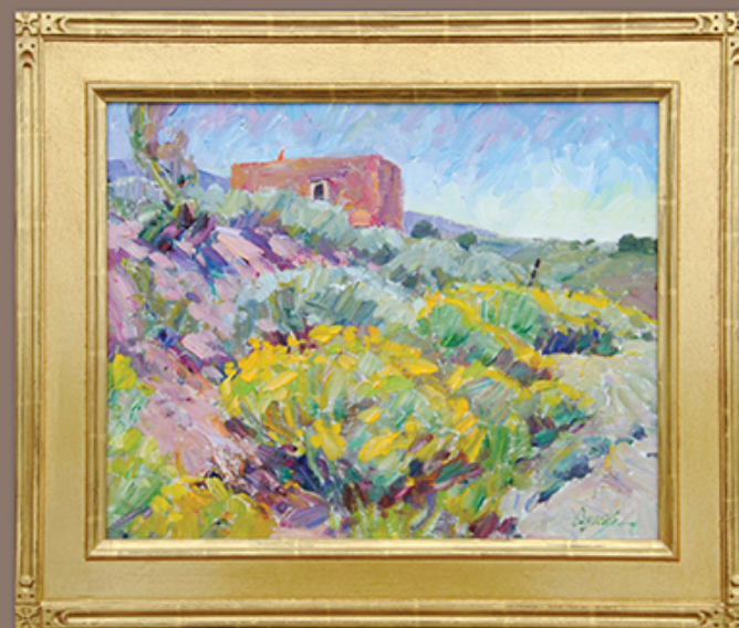
Ranchos de Taos 16 x 20, oil