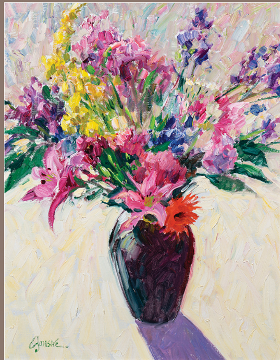
Floral Arrangement, 26 x 22, oil