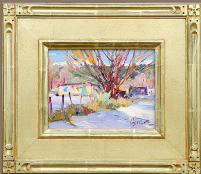
Mora Valley, 6 x 8, oil