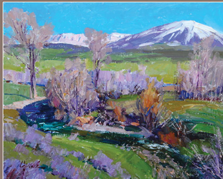
Little Mill Creek, 16 x 20, oil