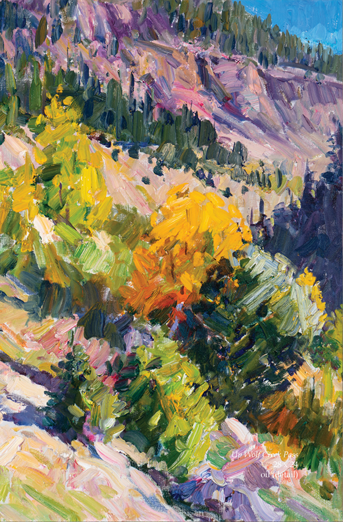
Up Wolf Creek Pass 28 x 24 oil (detail)