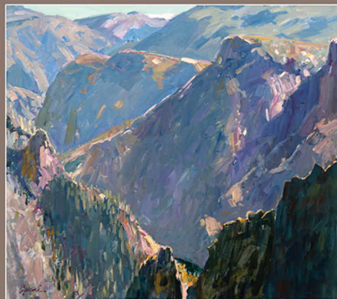
The Black Canyon from Tomichi Point, 30 x 34, oil