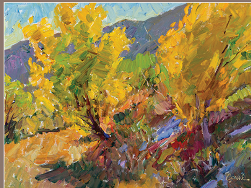
Young Cottonwoods 18 x 24, oil